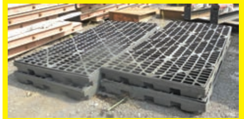
(4) CONTAINMENT CONTAINER/ SPILL KIT