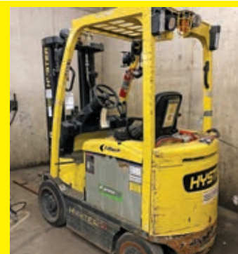
2010 HYSTER E050XN SN:A268N03608H electric powered, OROPS, 5,000lb lift capacity, 3-stage mast, sideshift, 38.5in. Carriage, 42in. Forks, charger.