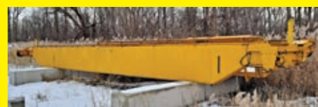
1/2 TON CRANE 30ft. Span.