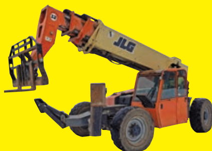
JLG G12-55 4x4, diesel engine, EROPS, 12,000lb lift capacity, 55ft. Reach height, front stabilizers.