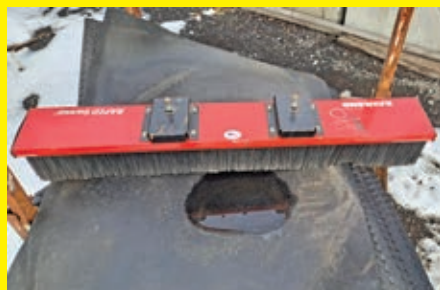
RAYMOND RAPID SWEEPER 6FT. FORKS 6 ton capacity.