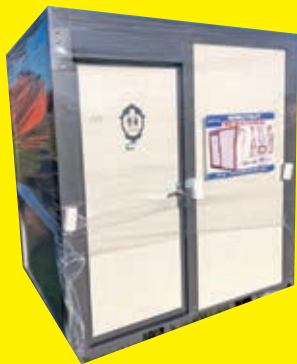
NEW BASTONE 110V PORTABLE TOILET W/ DOUBLE STALL