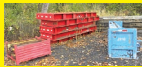
(4) 4FT. X 15FT. STEEL CRANE MAT