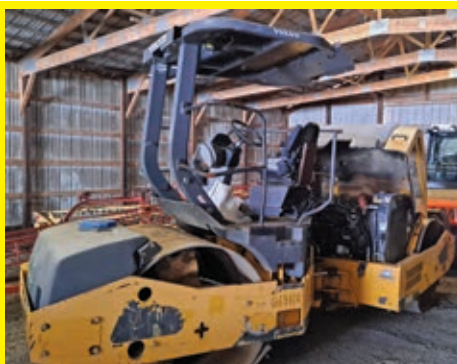
2014 VOLVO DD110B SN:V085018 diesel engine, OROPS, 66in. Smooth drum, double drum, vibratory drum, drum drive, front & rear spray bars.