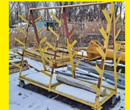
METAL RACK ON WHEELS