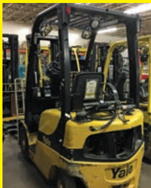
2014 YALE GLP030VXNURE08 LP engine, OROPS, 3,000lb lift capacity, 3-stage mast, sidishift.