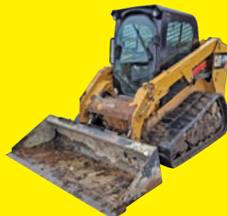
2014 CAT 279D SN:GTL00702 Cat diesel engine, EROPS, auxiliary hydraulics, mechanical quick coupler, rubber tracks, GP bucket.

BOBCAT T190 diesel engine, EROPS, air, heat, auxiliary hydraulics, mechanical quick coupler, rubber tracks, 72in. GP bucket, 1,580 hours. Has engine issues.