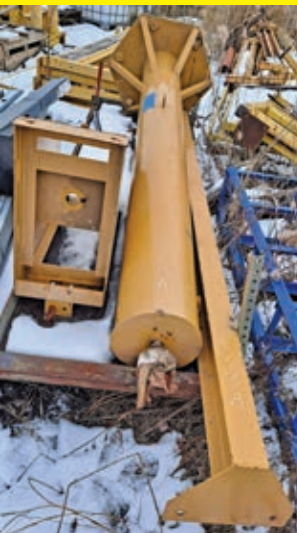
1 TON JIB CRANE