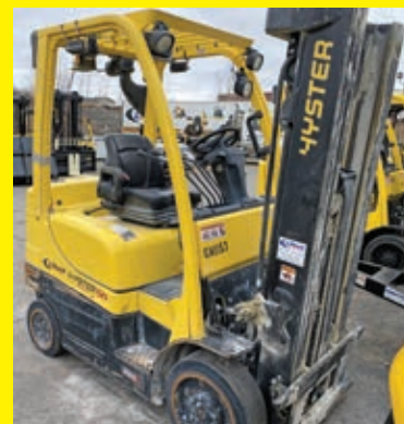
2014 HYSTER S050FT LP engine, OROPS, 5,000lb lift capacity, 189in. 3-stage mast, 38.5in. Carriage.