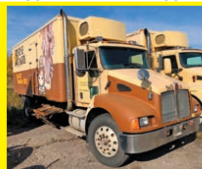
2005 KENWORTH T300 VN:104112 Cat C7 diesel engine, Eaton 6 speed transmission, power steering, cold plate body, dual wheel single axle. Does not Run. (No Compression in Motor).