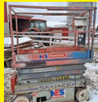
SKYJACK 3219 SN:225102 electric powered, 19ft. Platform height, slide out deck, 500lb lift capacity (3) GENIE GS3226 electric powered, 26ft. Platform height, slide out deck, 500lb lift capacity. (10) HYBRID 1430 electric powered, 14ft. Platform height, slide out deck, 500lb lift capacity. MEC 1632 electric powered, 16ft. Platform height, slide out deck, 500lb lift capacity, 376 hours.