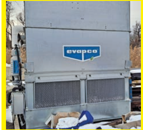
EVAPCO ATC-170E INDUSTRIAL EVAPORATIVE CONDENSER