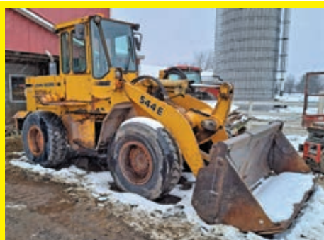
JOHN DEERE 544E SN:DW544ED533737 John Deere diesel engine, EROPS, 3rd valve hydraulics, 4-in-1 GP bucket, 17.5R25 rubber.

KUBOTA R530 Kubota diesel engine, EROPS, GP bucket.