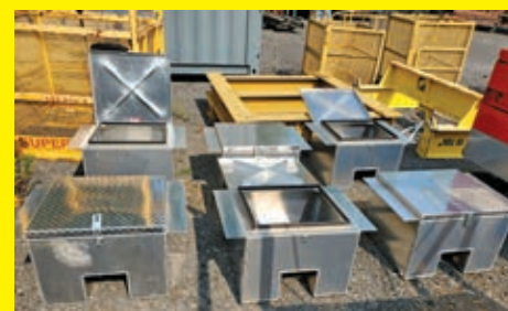
(6) NEW ROAD GEAR TRACTOR STORAGE/ TOOL BOX