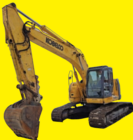
2012 KOBELCO SK235SR SN:YU0603226 diesel engine, Cab, reduced tail swing, digging bucket

(2) 2015 BOBCAT E26 diesel engine, Cab, front blade, rubber tracks, digging bucket.