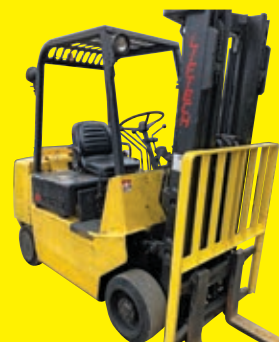
HYSTER S50XL LP engine, OROPS, 5,000lb lift capacity, 3-stage mast.

HYSTER S50XM LP engine, OROPS, 5,000lb lift capacity, 16ft. Reach height, sideshift, 42in. Forks, pneumatic tires.