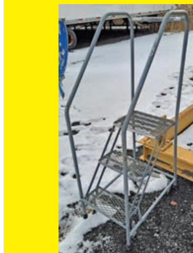
(2) METAL SHOP STAIRS