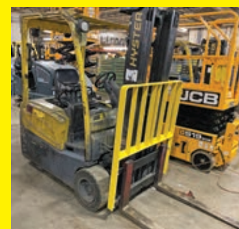
2011 HYSTER electric powered, OROPS, 3-stage mast, sideshift, load back rest, charger.

HYSTER S50XM LP engine, OROPS, 5,000lb lift capacity, 16ft. Reach height, sideshift, 42in. Forks, pneumatic tires.