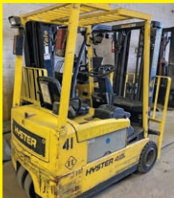
HYSTER J040XNT VN:H160N03361Z electric powered, OROPS, 4,000lb lift capacity, 175in. Reach height, 38.5in. Carriage, 42in. Forks, charger.