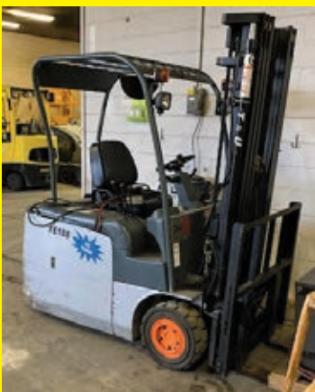
2012 TRUK ALONG electric powered, OROPS, charger.