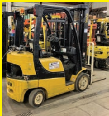
2014 YALE GLC050 SN:B910V02226M LP engine, OROPS, 5,000lb lift capacity, 194in. 3-stage mast, 38.5in. Carriage, 42in. Forks, cushion tires.