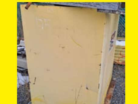
METAL CABINET, FLAMMABLE MATERIALS HEAVY DUTY LOADING DOCK, 33FT. X 8FT. 6IN. WIDE 3IN. TSURUMI PUMP Honda gas engine. 2010 CEP 6506GU POWER CENTER SN:8689