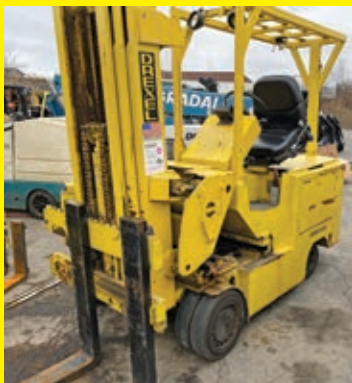
DREXEL electric powered, OROPS, charger. CAT GP20K LP engine, OROPS, 4,000lb lift capacity, 3-stage mast, sidishift, pneumatic tires. Does Not Run.