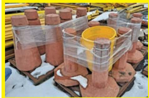
(14) CONCRETE BARRIER POLE