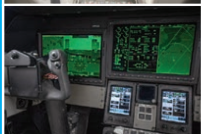
AVIONICS Garmin G5000 w/high resolution displays