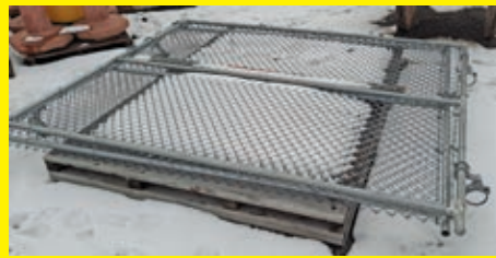
(2) COMMERCIAL FENCE 9'6" wide, 8' Tall (each piece).