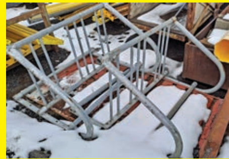
(2) COMMERCIAL BIKE RACK