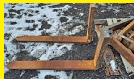
(3) 4FT. FORKS