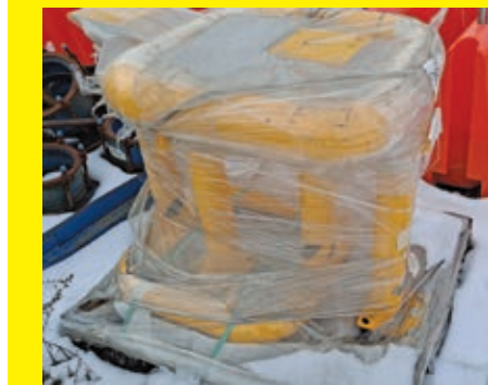
SAFETY RAILS-PROTECTION FOR GAS METER OR SIMILAR