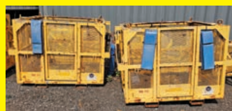
DFA-110 4-PERSON MAN BASKET 1,000lb capacity