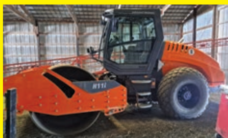
UNUSED HAMM H111 Deutz TCD3.6L4 diesel engine, EROPS, air, heat, 84in. Smooth drum, vibratory drum, drum drive, water system, 381 hours.