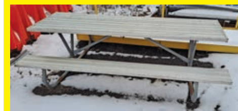
ALUMINUM PICNIC TABLE