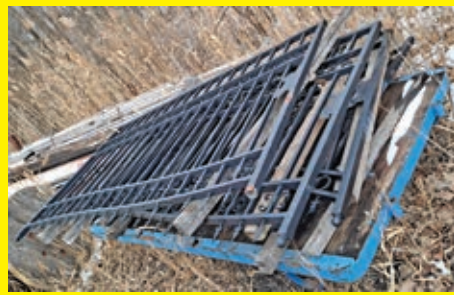
(2) DECORATIVE GATE (2 sections 10' wide 7' tall each).

(2) PALLET OF BLUE STONE (2) 3 YARD DUMPSTER ON WHEELS (3) (2) LP TANKS (2) 4-DRAWER FILE CABINET (2) 4FT. X 4FT. JUST RITE SPILL CONTAINMENT PALLET (8) 32FT. HEAVY DUTY PALLET RACK (2) PALLET JACK 5,000lb capacity, 48in. Forks. PALLET JACK 4,000lb lift capacity, 48in. Forks, batteries & built in charger. RYOBI 10IN. TABLE SAW BENCH MOUNT CRAFTSMAN 10 GALLON SHOP VAC CRAFTSMAN 20 GALLON SHOP VAC TENNANT WALK BEHIND FLOOR SCRUBBER 10 gallon capacity. (2) LOADING DOCK WEATHER SURROUND & BUMPER SET 40 GALLON INDUSTRIAL PARTS WASHER bench mounted, 500lb capacity. (2) NESTA-FLEX ROLLING FLEXIBLE CONVEYOR 24IN. X 25FT. LONG (4) 10FT. TALL, 32FT. RUN HEAVY DUTY PALLET RACK (2) 36 VOLT INDUSTRIAL BATTERY CHARGER 7FT. X 8FT. HYDRAULIC LOADING DOCK LEVELER 15,000lb capacity.