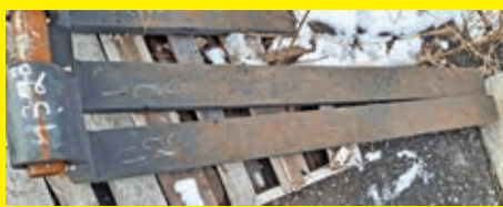
6FT. FORKS 5 ton capacity.