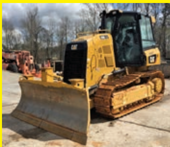
2020 CAT D3KXL Cat diesel engine, EROPS, air, heat, 6 way blade, long track frame, very low hours.

KAWASAKI 80Z SN:80C4-5212 diesel engine, EROPS, GP bucket.