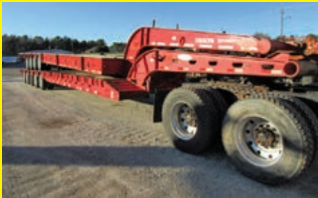
2012 ADVANCE VN:1A9SL6556CP745066 162K# GVWR, detachable neck, 48ft. X 108in. deck, air ride suspension, pop up deck rollers, tail roller, (5) axles.