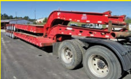
2011 ADVANCE VN:1A9SL6555BP745039 154K# GVWR, detachable neck, 48ft. X 108in. deck, air ride suspension, pop up deck rollers, tail roller, (5) axles.