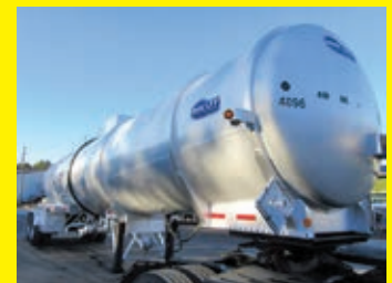
2015 MAC VN:558MCCM27FK001033 9300 gallon aluminum tank, Civicon scales, level monitor, liner, air ride suspension, tandem axle.