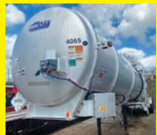
2015 MAC 407 VN:58MCCM27FK001002 9300 gallon, air ride suspension, bottom load, vapor recovery, Air Weigh trailer scale, Finch level monitor, Civicon signal system, 11R22.5 tires, polished aluminum wheels, tandem axle.