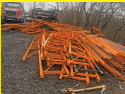
(4) PALLET RACKING