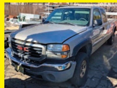
2006 GMC K2500 VN:1GTHK29U46E275963 4x4, V8 gas engine, automatic transmission, power steering, extended cab, 8ft. Bed.