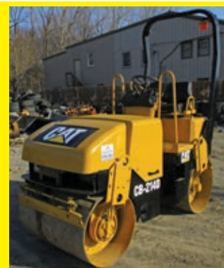
CAT CB214D SN:1TZ00391 Cat diesel engine, ROPS, 40in. Smooth drum, vibratory drum, double drum, drum drive, water system.