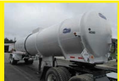
2015 MAC VN:558MCCM21FK001027 9300 gallon aluminum tank, Civicon scales, level monitor, liner, air ride suspension, tandem axle.