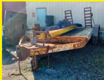
1999 EAGER BEAVER 7 TON VN:112ACH203YL054378