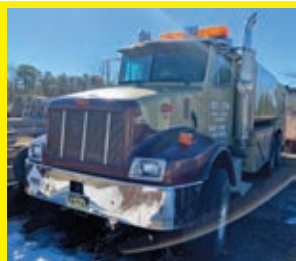
2005 PETERBILT 330 VN:2NPNLZ0X85M837192 Cummins diesel engine, Eaton Fuller transmission, power steering, Off Road Fuel Tank, On Road Fuel Tank, Oil, Hydraulic, Antifreeze, Grease Reels, On Board Air Compressor, dual wheel single axle, 252,000 miles.