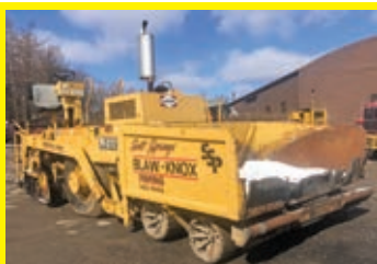
BLAW KNOX PF3172 SN:317201-08 Cummins 4BTA 3.9C diesel engine, dual operator stations, Omni III screed, 16.00-24TG rear tires.