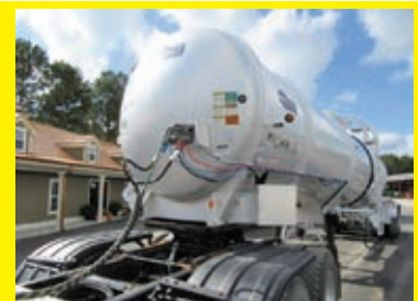
2015 MAC VN:558MCCM25FK001029 9300 gallon aluminum tank, Civicon scales, level monitor, liner, air ride suspension, tandem axle.