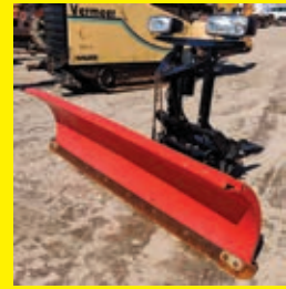
WESTERN 8 1/2FT. SNOW PLOW