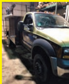
2005 FORD F550 VN:1FDAF57P25EC56648 6.0 diesel engine, automatic transmission, power steering, service body, crane, dual wheel single axle, 240,000 miles.