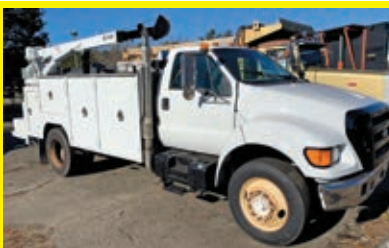
FORD F650 VN:3FDNF65B03MB07774 Cummins 5.9 diesel engine, power steering, service body, crane, fuel, oil, hydraulic, and antifreeze tanks, dual wheel single axle.