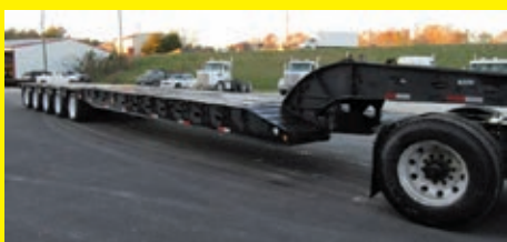
2008 ADVANCE VN:1A9SL65528P745010 162K# GVWR, 46ft. X 108in. deck, detachable neck, air ride suspension, pop up deck rollers, tail roller, (5) axles.