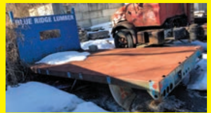
8FT. X 14FT. LUMBER FLATBED