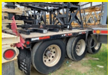
NELSON CBC-30S VN:012383 air ride suspension, 11R22.5 tires, 3-axle.