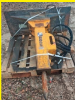
ARROWHEAD R65S HYDRAULIC HAMMER SN:W005427