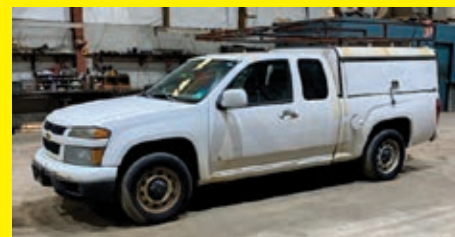
2009 CHEVY COLORADO VN:1GCCS19E998148920 Does not Run.

2015 NISSAN FRONTIER SN:1N6AD0EV3FN753916 4x4, diesel engine, automatic transmission, power steering.