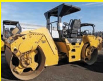
2011 CAT CB54XW SN:JLM00362 Cat diesel engine, OROPS, hydrostatic, 79in. Smooth drum, double drum, Versa-Vibe, water system, off-set hitch option.