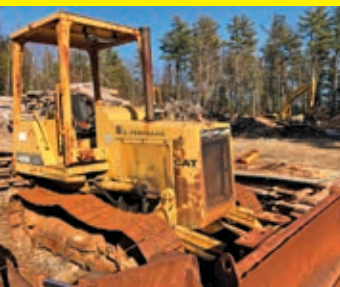
CAT D3B SN:23Y02508 Cat diesel engine, EROPS, 6 way blade.