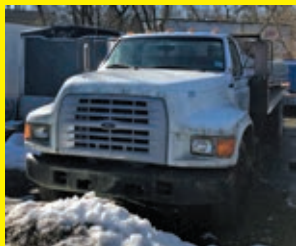
1995 FORD F750 V8 gas engine, automatic transmission, power steering, 22ft. Jer-dan rollback body, winch, air brakes, 28,000 GVW, dual wheel single axle, 103,044 miles