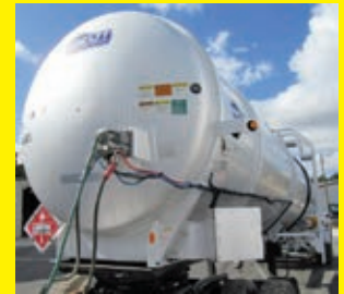
2015 MAC VN:558MCCM29FK001020 9300 gallon aluminum tank, Civicon scales, level monitor, liner, air ride suspension, tandem axle.