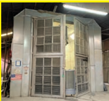
20ft width, 46ft length, galvanized steel, lighting, ventilation fans.