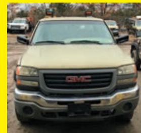
2004 GMC 2500 VN:1GDHK23U64F210883 4x4, gas engine, utility body.

2005 FORD F450 VN:1FDXF46P25EA45603 4x4, Power stroke diesel engine, power steering, PTO, utility body, hydraulic reservoir w/ hose connections, tool box, emergency light package, dual wheel single axle, 90,000 miles.