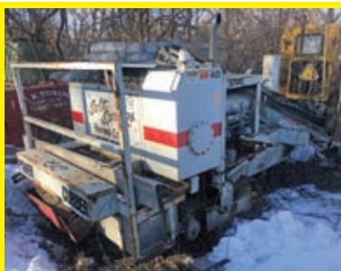
POWERCURBER 5700 SIDEWALK & GUTTER SN:57088163 Deutz diesel engine, molds, 2,356 hours.