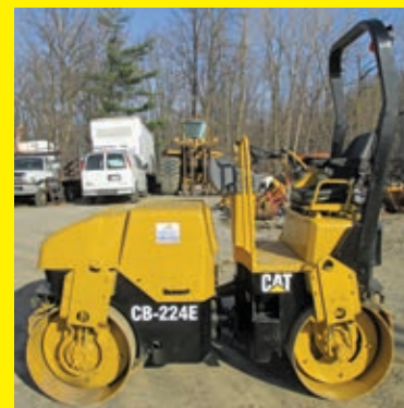
CAT CB224E SN:22403403 Cat diesel engine, ROPS, 47in. Smooth drum, vibratory drum, double drum, drum drive, water system.