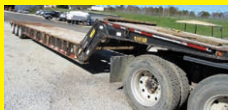
2008 LOAD KING VN:5LKL5335581027211 50 ton capacity, scissor neck, 42ft. X 102in. deck, 9ft. upper deck, air ride suspension, triaxle.