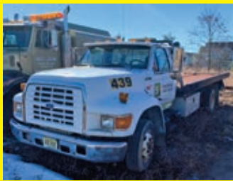
1997 FORD F800 VN:FDNF80C5VVA07416 Cat 3126 diesel engine, power steering, Jer-dan rollback body, dual wheel single axle, 198,000 miles.