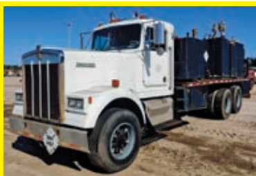
1984 KENWORTH VN:2NKWL29XDEM320182 diesel engine, power steering, 1,000 Gallon Fuel Tank, On Board Air Compressor, Oil, Waste Oil, Hydraulic, Antifreeze, Grease Reels, tandem axle, 292,000 miles.