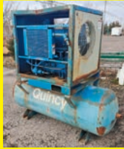
QUINCY AIR COMPRESSOR SN:83196