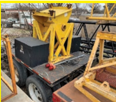
285/75R24.5 tires, 2-axle.