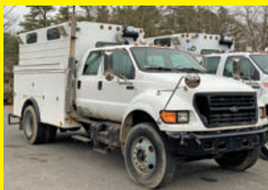
2000 FORD F750 VN:3FDXW75HXMYA70776 Cat 3126 diesel engine, Allison automatic transmission, power steering, crew cab, enclosed utility body, On Board Air Compressor, air brakes, dual wheel single axle. Former Utility Company Owned.