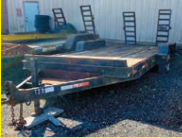
2018 HOME MADE 7 TON VN:HMDCP2018123

(4) NEW 2021 DELTA 20FT. VN:N/A 20ft. X 7ft. Tilt deck, 14,000lb GVWR, electric brakes, Bulldog 10,000lb jack, adjustable hitch, chain storage, LED lights, tandem axle.