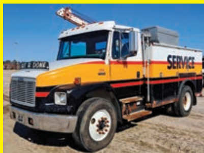
FREIGHTLINER VN:VNF30351 diesel engine, power steering, service body, crane, dual wheel single axle.

2012 DODGE 5500 VN:3C7WDNBL8CG213428 4 x 4, Cummins 5.9L diesel engine, 6 Speed Automatic transmission, power steering, Cruise, Tilt, AM-FM, power brakes, Rear Camera, Reading Model MM378, Heavy-Duty Crane 14' body, 60" Tall Cabinets, Slide out tool draws, Honda Powered Air Compressor w/ electric start with reel, LED lit Cabinets, LubeMate/Graco Lube System 50' reels with Oil (2), Grease and Waste Recovery, LED Work Lights, Front & Rear Service Truck 12v Jumper Setup, Oxygen/ Acetylene Tank ready compartment, Class V Hitch w/ Electric Brake Controller, HD Rear Bumper w/Vise, dual wheel single axle.