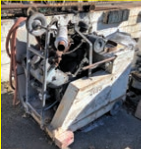
CORE CUT CC3500 WALK BEHIND SAW Wisconsin gas engine, 14-48in. Capacity.

PALLET OF STAINLESS STEEL TAPPING SLEEVES CASE (25) OF POSSEWARE THROW AWAY COVERALLS 17IN. FLOOR BUFFER 27IN. X 18IN. X 41IN. ROLLING TOOL BOX