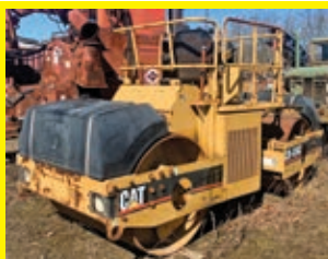
CAT CB434C SN:4DN00100 Cat diesel engine, ROPS, 56in. Smooth drum, vibratory drum, double drum, drum drive, water system, 2,224 hours.