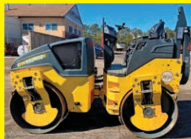
2014 BOMAG BW138AD-5 SN:650301334 diesel engine, ROPS, 54in. Smooth drum, vibratory drum, double drum, drum drive, water system.