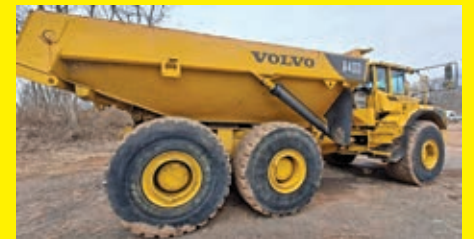
VOLVO A40D SN:A40DV12156 6x6, diesel engine, EROPS, air, heat, retarder, 40 ton capacity, tailgate.