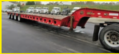
2013 PITTS VN:5JYLB6049DP130239 60 Ton capacity, fixed neck, 42ft. X 102in. deck, air ride suspension, front, mid & tail rollers, 255/70R22.5 tires, (4) axles.