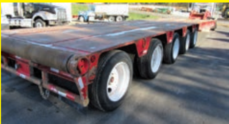
2011 ADVANCE VN:1A9SL6554CP745065 154K# GVWR, detachable neck, 48ft. X 108in. deck, air ride suspension, pop up deck rollers, tail roller, (5) axles.