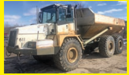
TEREX TA30 SN:A7991471 6x6, 6 cylinder diesel engine, Cab, 30 ton capacity, 23.5R25 rubber.

2018 BELL B30E SN:2008024 6x6, Mercedes diesel engine, Cab, air, heat, rearview camera, 30 ton capacity, 23.5R25 rubber.