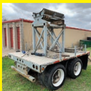
22.5 tires, 2-axle.