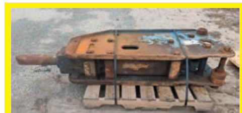
OKADA 308 SN:2502

NEW TROJAN 200CL 80mm pins fits to: Cat 320/321/323, Hyundai R210, Komatsu PC200/220, Deere 160/200/225, Kobelco SK210, Case 210/225, Doosan DX225. NEW TROJAN 120CL 65mm pins fits to: Cat 311/312/313/314 Kobelco 140, Deere/Hitachi ZX120/135, Case 130/135, Doosan DX140. (2) NEW TROJAN 80CL 65mm pins fits to: Cat 311/312/313/314 Kobelco 140, Deere/Hitachi ZX120/135, Case 130/135, Doosan DX140. (2) NEW TROJAN 50CL 45mm pins fits to: Cat 305, 305.5 Komatsu PC45/50/55, Hyundai R55, Hitachi/Deere 50D/G, Case, New Holland, Kobelco SK50, Bobcat E50/341/337. (2) NEW TROJAN 35CL 40mm pin fits to: Cat 303, 303.5, 304, Case, New Holland, Kobelco SK35, Deere/Hitachi 35D/G. NEW DIESEL 120CL 65mm pins fits to: Cat 311/312/313/314 Kobelco 140, Deere/Hitachi ZX120/135, Case 130/135, Doosan DX140. 2015 ARROWHEAD R65S SN:R65061504 2014 ARROWHEAD R60 SN:S60121301