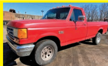
1991 FORD F150 VN:1FTDF15Y7MNA67658 gas engine, 8ft. Bed, 189,302 miles.