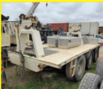
445/65R22.5 tires, 3-axle.