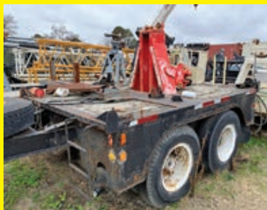
10.00-20 tires, 2-axle.