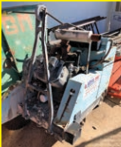
TARGET PRO65 II WALKBEHIND Wisconsin gas engine, 14-48in. Capacity.