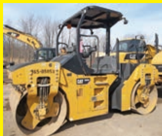
2014 CAT CB44B SN:NSL00178 Cat diesel engine, OROPS, hydrostatic, 59in. Smooth drum, vibratory drum, drum drive, water system, dual amplitude and frequency system, water system, swivel operator station, 1,925 hours.