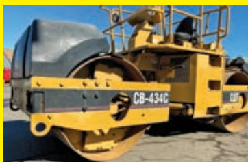
CAT CB434C SN:04DN00231 Cat diesel engine, OROPS, 56in. smooth drum, vibratory drum, double drum, drum drive, water system.