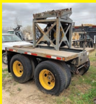
NELSON CBC-20S VN:012396 11R22.5 tires, 2-axle. VN:650180 air ride suspension, 11R22.5 tires, 3-axle.