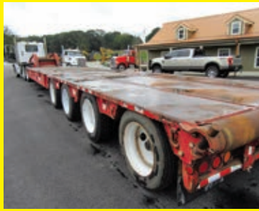
2012 HOLDEN VN:12HLX5749CN602610 60 ton capacity, fixed neck, 46ft. X 102in. deck, extendable to 68ft. air ride suspension, front, mid & tail rollers, 255/70R22.5 tires, (4) axles.