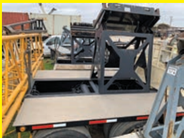
NELSON CBC-30S VN:012504 64,800 GVWR, air ride suspension, 11R22.5 tires, 2-axle.