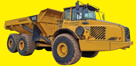
VOLVO A40D SN:A40DV12351 6x6, diesel engine, EROPS, air, heat, retarder, 40 ton capacity, tailgate.

TEREX TA30 SN:A7991566 6x6, 6 cylinder diesel engine, Cab, 30 ton capacity, 23.5R25 rubber.