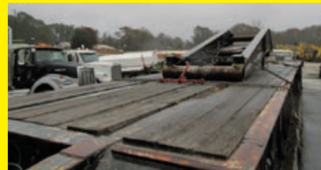
2005 HOLDEN VN:1HMD64575N609672 164K# GVWR, detachable neck, 48ft. X 108in. deck, air ride suspension, pop up deck rollers, tail roller, (5) axles.