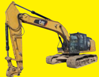
CAT 330CL SN:CAP01408 Cat diesel engine, Cab, reach boom, 54in. digging bucket, long undercarriage.

2013 CAT 329EL SN:PLW01139 Cat diesel engine, Cab, air, reach boom, 10ft. 6in. Stick, auxiliary hydraulics, Cat hydraulic quick coupler, 32in. TBG pads, Cat 36in. digging bucket w/ thumb bracket, long undercarriage.