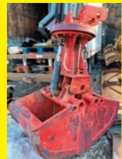
66IN. HYDRAULIC ANGLE DITCHING BUCKET fits Cat 315/316.