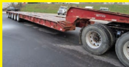
2009 NUTTALL VN:4C9DW57579A061246 70 ton capacity, 45ft. X 102in. deck, detachable neck, air ride suspension, deck rollers, tail roller, (5) axles.