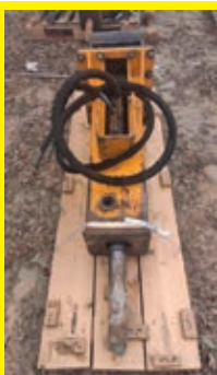
ARROWHEAD R75S HYDRAULIC HAMMER SN:79061611