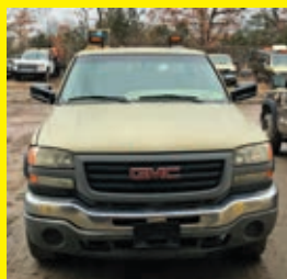
2005 GMC 2500 VN:1GDHK23U55F925039 power steering, utility body.