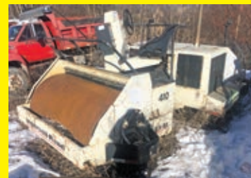
INGERSOLL RAND D50 SN:62125 Detroit diesel engine, ROPS, 74in. Smooth drum, vibratory drum, double drum, drum drive, water system, 1,721 hours.