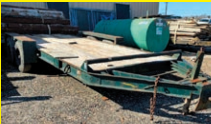
2017 HOME MADE 7 TON VN:HMDCP2018122