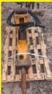
ARROWHEAD R65S HYDRAULIC HAMMER SN:W005493 2009 CTI 42IN. FORKS SN:47757