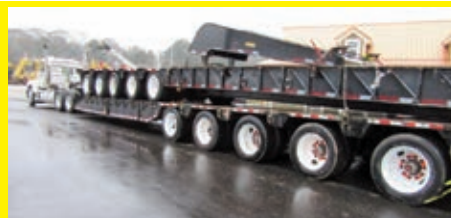
2005 LOADCRAFT VN:5ABB455045B050023 164K# GVWR, detachable neck, 45ft. X 108in. deck, air ride suspension, deck rollers, tail roller, (5) axles.