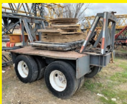
(2) 11R22.5 tires, 2-axle.