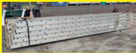
WERNER 24/20 FLOOR AUTO JACK (9) PROPANE TANKS HEAVY DUTY SHELVEING