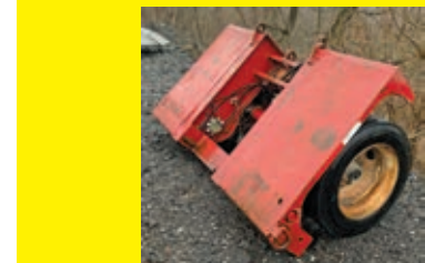
TALBERT GOOSENECK & FLIP DOWN AXLE VN:N/A refurbished.