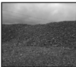
3/4 In. Stone