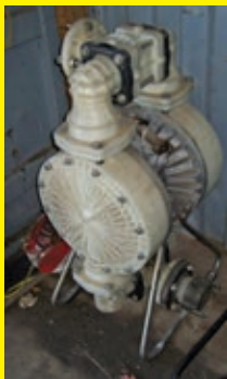
ARO DOUBLE DIAPHRAGM PUMP