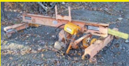
HARRINGTON 1 TON BRIDGE CRANE model MS3E-865 hoist.