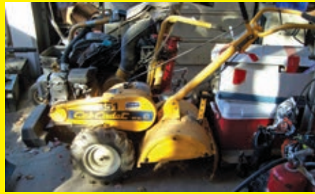
CUB CADET RT65 WALKBEHIND TILLER Honda gas engine.

(3) ELECTRIC CHAINFALL HOIST (2) GARAGE DOOR OPENER