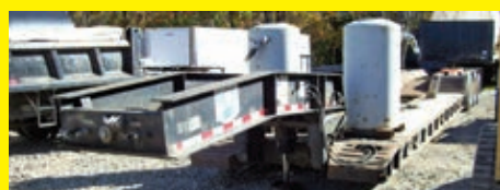
2015 WITZCO RG-50 DETACHABLE VN: 000205 50 ton capacity, ground bearing, 22ft. x 102in. level deck with outriggers, Hutchens spring suspension, 11R22.5 tires, triaxle.