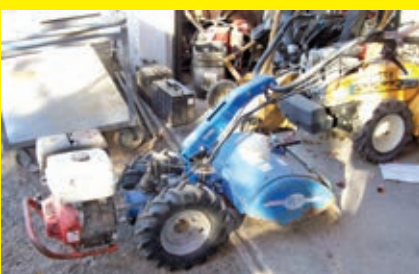
BCS GX8 WALKBEHIND TILLER Honda gas engine.