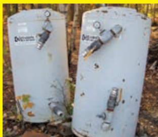
TETRASOLV FILTRATION AF-500 MEDIA FILTRATION VESSEL