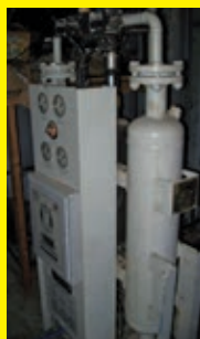
DHA AMLOC ENERGY SAVER DRYER DOUBLE DIAPHRAGM PUMP