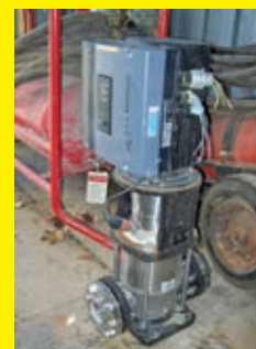
GRUNDFOS 65GPM CENTRIFUGAL WATER PUMP electric powered.