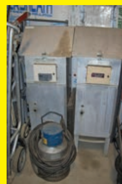
AIR POLLUTION MONITORING SYSTEM AIR SAMPLING UNIT