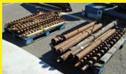
EARTHPROBE 200 AUGER TOOLING