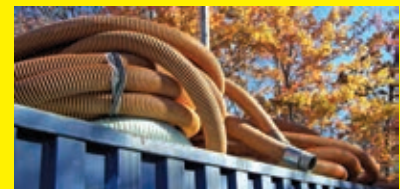
QTY OF 4IN. SUCTION HOSE