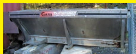
CURTIS TS-17 ALUMINUM 8FT. SALT SPREADER gas engine.