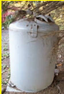
CETCO ACTIVATED CARBON TANK