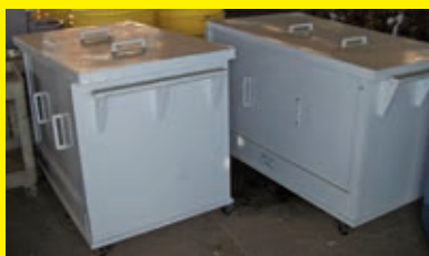
CSSI CHEMICAL STORAGE CABINET