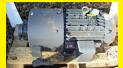
BALDOR-RELIANCE INVERTOR DRIVE MOTOR 15HP.