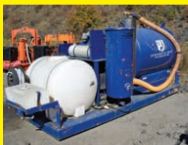
VAC-TRON 4 cylinder diesel engine, 959 hours, skid mounted