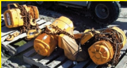
(3) HARRINGTON 2 TON ELECTRIC CHAINFALL HOIST

(3) ELECTRIC CHAINFALL HOIST (2) GARAGE DOOR OPENER