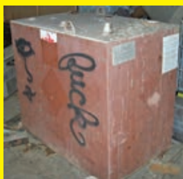
CONTAINMENT SOLUTIONS 280 GALLON TANK SN: 634519