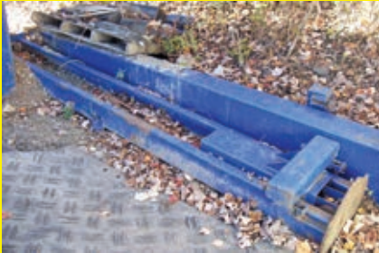
2-POST CAR LIFT