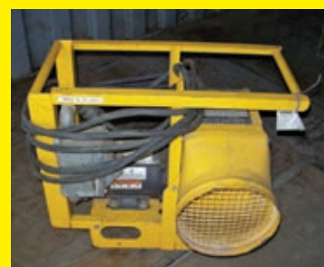
AIR SYSTEMS BLOWER W/ EMERSON HAZARDOUS LOCATION MOTOR