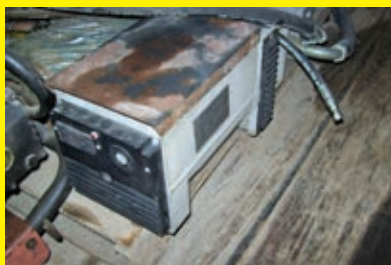
GETECH HYDRAULIC GENERATOR