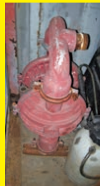
WILDEN PUMP M8 DOUBLE DIAPHRAGM PUMP