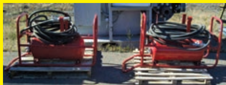
DRY CHEMICAL FIRE EXTINGUISHERS GENERAL EP8 BLOWER gas engine.