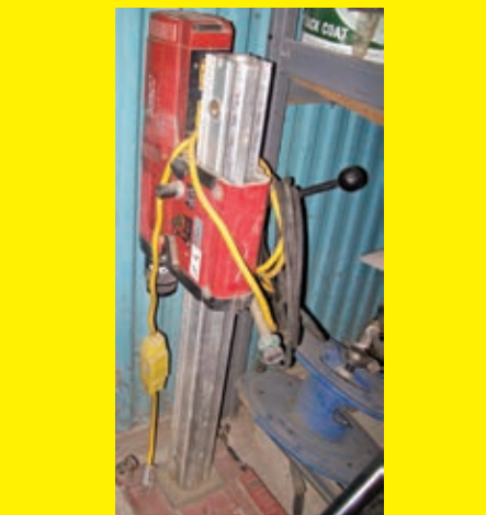
HILTI DD-160E CORE DRILL electric powered.