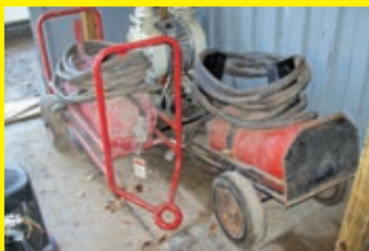
KIDDE DRY CHEMICAL FIRE EXTINGUISHERS Towable.