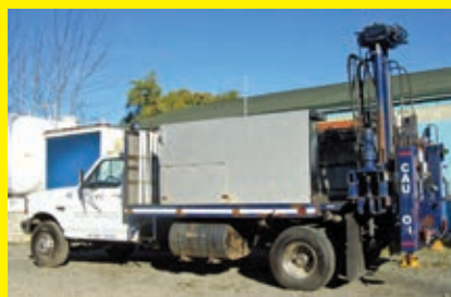
1995 FORD F450 VN: A13303 Powerstroke diesel engine, 5 speed transmission, power steering, 10ft. body with aluminum diamondplate sides, Hogentogler Cone Pentrometer Testing Drill, LT235/85R16 tires, dual wheel single axle.