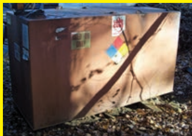
CONTAINMENT SOLUTIONS 1000 GALLON TANK SN: A634514 Suntec CB2500 pump.