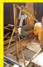
HERCULES CI-322 FIXED BOOM FLOOR CRANE