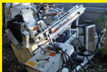
AMS PROBE 9600 EC DIRECT PUSH AUGER DRILL SN: 476 with auger tooling, skid mounted.