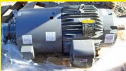
BALDOR-RELIANCE INVERTOR DRIVE MOTOR 10HP.