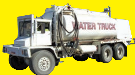
1999 ADVANCE 1A9TAC WATER TRUCKS VN: 007618 6x6, Cat diesel engine, automatic transmission, power steering, Housby tank with water canon, side & rear spray heads, tandem axle.