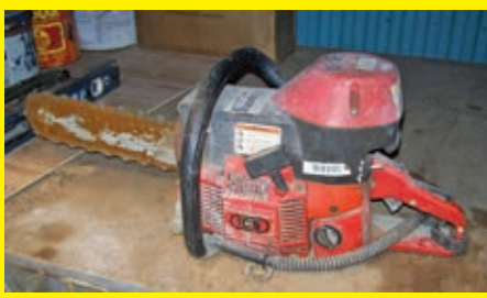
ICS CONCRETE CUTTING CHAINSAW gas engine, water system.