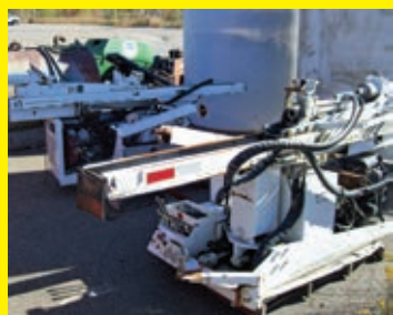
SIMCO EARTHPROBE 200 DIRECT PUSH PROBING Kohler gas engine, skid mounted.