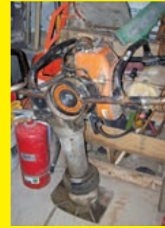
MBW R270 JUMPING JACK gas engine. PRESSURE WASHER