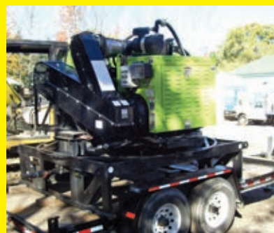
C.W. MACHINE WORX THE HAWK/ DUST DESTROYER 300-80-D SN: 108-010-018 Yanmar diesel engine, manual clutch, Axwane 2000 Series fan with 360 degree rotation, mounted on a 2013 Towmaster T-10D trailer, LT235/85R16 tires, VIN 4KNUT1427DL161824.