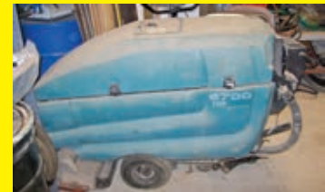
TENNANT 5700XP FLOOR SCRUBBER WALKBEHIND PAVEMENT EQUIPMENT SN: 761001 Honda gas engine.