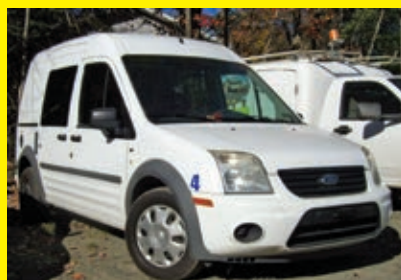
2010 FORD TRANSIT VN: 013481 2.0L diesel engine, automatic transmission, power steering, P265/65R15 tires, 138,760 miles.