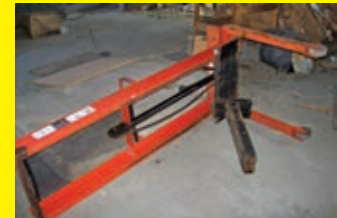
(2) PRESTO 1000LB LIFT