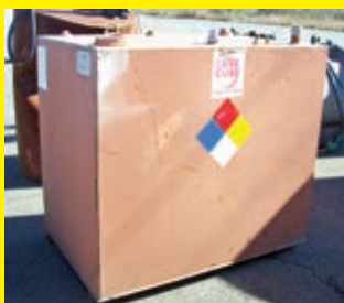
CONTAINMENT SOLUTIONS 650 GALLON TANK SN: 634517 CONTAINMENT SOLUTIONS 650 GALLON TANK SN: 634518