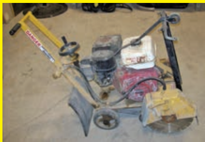
ASE TAZMANIAN WALK BEHIND PAVEMENT SAW gas engine, dust collector.