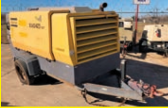
LOT 149: 2014 ATLASCOPCO XAS750 JDIT4 SN:HOP081313 John Deere diesel engine, 750CFM, trailer mounted.