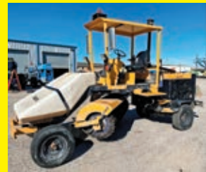
LOT 123: 2016 LAYMOR SM400 SN:37256 diesel engine, EROPS, 8ft. Sweeper, water system, 369 hours.