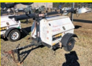
LOT 174: 2015 MAGNUM PRO MLT4150 SN:1505197 diesel engine, 4-1,000 watt lightbulbs, trailer mounted.