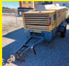
LOT 276: 2010 ATLASCOPCO XAS750CD6 SN:HOP080356 diesel engine, 750CFM, trailer mounted.