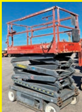
LOT 180: 2013 SKYJACK SJIII4626 SN:70015257 electric powered, 26ft. Platform height, slide out deck, 500lb lift capacity, 281 hours.