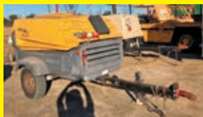
LOT 188: 2015 ATLASCO PCO XAS185KD7 IT4 SN:HOP049080 diesel engine, 185CFM, trailer mounted.