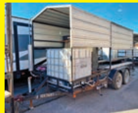
LOT 124: 2016 COOL ZONE 16FT. VN:5RHCT162XGH002989 tandem axle.