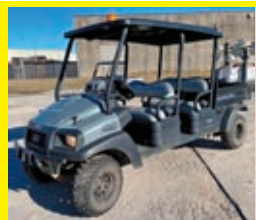
LOT 102: 2017 CLUB CAR CARRYALL 1700 SN:846842 4x4, diesel engine, EROPS, 4-seater, utility body, 926 hours.