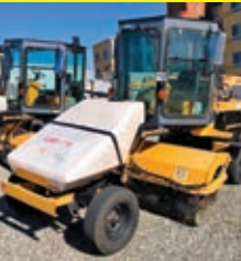
LOT 146: 2015 LAYMOR SM400 SN:35708 diesel engine, EROPS, 8ft. Sweeper, water system, 722 hours.