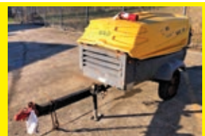
LOT 191: 2014 ATLASCO PCO XAS185JD SN:HOP045765 John Deere diesel engine, 185CFM, trailer mounted.