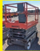
LOT 161: 2016 SKYJACK SJIII4626 SN:70029020 electric powered, 26ft. Platform height, slide out deck, 500lb lift capacity, 206 hours.