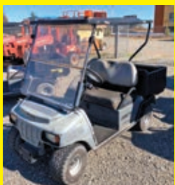
LOT 102: 2016 CLUB CAR CARRYALL 100

SN:SZ1639680245 gas engine, OROPS, utility body, 1,410 hours.