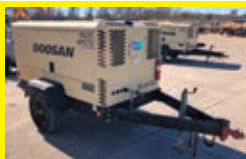
LOT 133: 2014 DOOSAN P425/HP375WCUT4 SN:462503UCYF15 Cummins diesel engine, 425CFM, trailer mounted.