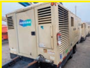
LOT 132: 2015 DOOSAN HP1600WCU-T4I SN:465214UGYE97 Cummins diesel engine, 1,600CFM, trailer mounted.