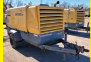
LOT 266: 2015 ATLASCOPCO XATS750 SN:HOP081275 John Deere diesel engine, 750CFM, trailer mounted.