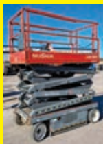
LOT 127: 2014 MEC 4069ERT SN:13400127 electric powered, 40ft. Platform height, slide out deck, 500lb lift capacity, 403 hours.