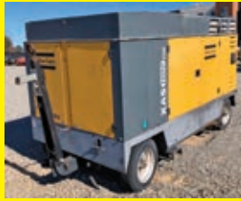
LOT 237: 2011 ATLASCOPCO XAS1600CD6 SN:APP168611 Cummins diesel engine, 1,600CFM, trailer mounted.