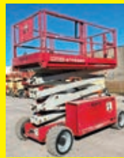
LOT 175: 2016 GENIE GS-4069DC SN:GS6916F-9618 electric powered, 40ft. Platform height, slide out deck, 500lb lift capacity, 356 hours.