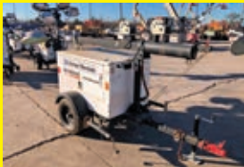
LOT 258: 2017 MAGNUM PRO MLT3060 SN:3001867705 diesel engine, 4-1,000 watt lightbulbs, trailer mounted.