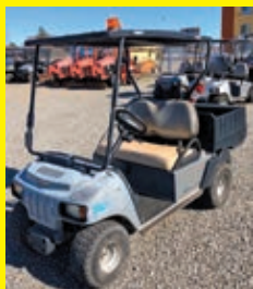
LOT 104: 2016 EZ-GO 1600XD SN:SZ9500016 4x4, diesel engine, OROPS, utility body, 1,060 hours.

SN:MC1639-679855 gas engine, OROPS, utility body, 1,022 hours.