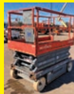
LOT 181: 2013 SKYJACK SJIII4626 SN:70014219 electric powered, 26ft. Platform height, slide out deck, 500lb lift capacity, 193 hours.