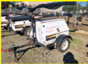
LOT 172: 2015 MAGNUM PRO MLT4150 SN:1505204 diesel engine, 4-1,000 watt lightbulbs, trailer mounted.