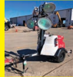
LOT 296: 2016 MAGNUM PRO MLT6SM SN:1604015

SN:3002295554 diesel engine, 4-1,000 watt lightbulbs, trailer mounted.