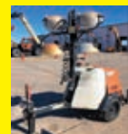
LOT 228: 2019 MAGNUM PRO MLT6SM SN:3004437089 diesel engine, 4-1,000 watt lightbulbs, trailer mounted.