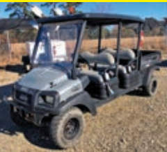
LOT 162: 2016 CLUB CAR CARRYALL 1700 SN:SD1707803501 4x4, diesel engine, OROPS, 4-seater, utility body, 2,130 hours.