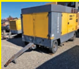
LOT 236: 2011 ATLASCOPCO XAS1600CD6 SN:APP143071 diesel engine, 1,600CFM, trailer mounted.