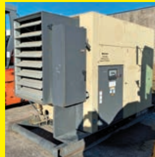
LOT 100: 2014 INGERSOLL RAND HH200 ROTARY SCREW AIR COMPRESSOR SN:TS4911U14103