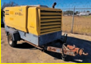
LOT 148: 2014 ATLASCOPCO XAS750 JDIT4 SN:HOP081312 John Deere diesel engine, 750CFM, trailer mounted.