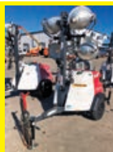
LOT 293: 2016 MAGNUM PRO MLT6SM SN:1604001

SN:3001543632 diesel engine, 4-1,000 watt lightbulbs, trailer mounted.