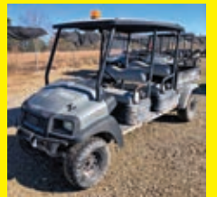
LOT 165: 2017 POLARIS RANGER SN:8051446 4x4, diesel engine, OROPS, 4-seater, utility body, 1,473 hours.