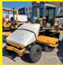
LOT 199: 2016 LAYMOR SM400 SN:36569 diesel engine, EROPS, 8ft. Sweeper, water system, 809 hours.