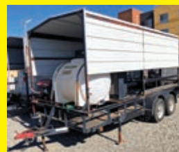
LOT 129: 2015 COOL ZONE 16FT.