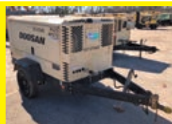
LOT 282: 2014 DOOSAN P425/HP375WCUT4 SN:462286UCYF15 Cummins diesel engine, 425CFM, trailer mounted.