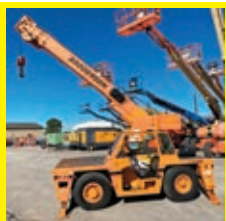
LOT 144: 2007 BRODERSON IC-80-3G SN:581681 Cummins diesel engine, OROPS, 9 ton lift capacity, 40ft. Reach height, outriggers, 4-wheel steering, 2,210 hours.