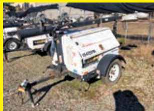
LOT 173: 2015 MAGNUM PRO MLT4150 SN:1501773 diesel engine, 4-1,000 watt lightbulbs, trailer mounted.