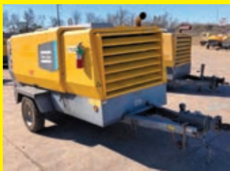
LOT 264: 2017 ATLASCOPCO XAS900 SN:HOP081598 diesel engine, 900CFM, trailer mounted.