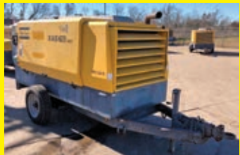
LOT 150: 2014 ATLASCOPCO XAS750 JDIT4 SN:HOP081332 John Deere diesel engine, 750CFM, trailer mounted.