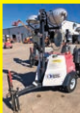
LOT 283: 2017 MAGNUM PRO MLT6SM

diesel engine, 4-1,000 watt lightbulbs, trailer mounted.