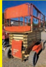
LOT 178: 2014 JLG 4069LE SN:0200225843 electric powered, 40ft. Platform height, slide out deck, 500lb lift capacity, 437 hours.