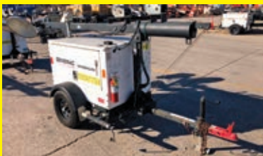
LOT 262: 2017 MAGNUM PRO MLT3060 SN:3001627944 diesel engine, 4-1,000 watt lightbulbs, trailer mounted.