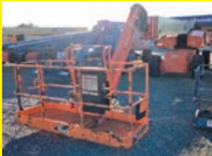
LOT 234: 2011 JLG 1200SJP SN:0300151173 4x4, diesel engine, 120ft. Platform height, straight boom, JIB, 500lb lift capacity.