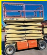
LOT 148: 2016 JLG 4069LE SN:0200253398 electric powered, 40ft. Platform height, slide out deck, 500lb lift capacity, 309 hours.