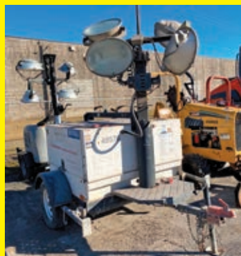
LOT 106: 2016 MAGNUM PRO MLT5200VCAN-POS SN:1508107 diesel engine, 4-1,000 watt lightbulbs, trailer mounted.