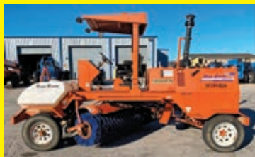
LOT 181: 2016 BROCE KR-350 SN:409774 diesel engine, EROPS, 8ft. Sweeper, water system, 1,240 hours.