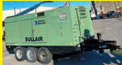
LOT 110: 2015 SULLAIR 900XHH-1150RXHA SN:201511180060RF diesel engine, 900CFM, trailer mounted, 1,998 hours.