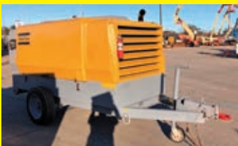
LOT 152: 2014 ATLASCOPCO XAS750 JDIT4 SN:HOP081327 John Deere diesel engine, 750CFM, trailer mounted.