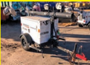
LOT 261: 2017 MAGNUM PRO MLT3060 SN:3002255513 diesel engine, 4-1,000 watt lightbulbs, trailer mounted.