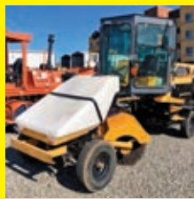
LOT 145: 2015 LAYMOR SM400 VISTA SN:36471 diesel engine, EROPS, 8ft. Sweeper, water system, 650 hours.