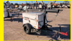
LOT 197: 2018 MAGNUM PRO MLT3060 SN:7FSBL1412JB788244 diesel engine, 4-1,000 watt lightbulbs, trailer mounted.