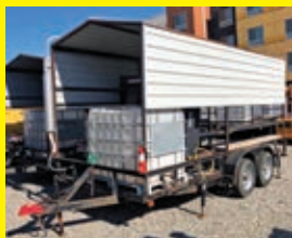
LOT 167: 2016 COOL ZONE 16FT.