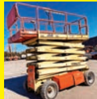
LOT 149: 2015 JLG 4069LE SN:0200250086 electric powered, 40ft. Platform height, slide out deck, 500lb lift capacity, 364 hours.