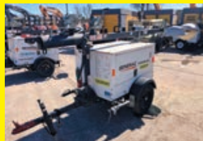
LOT 123: 2016 MAGNUM PRO MLT3060 SN:1605340 diesel engine, 4-1,000 watt lightbulbs, trailer mounted.