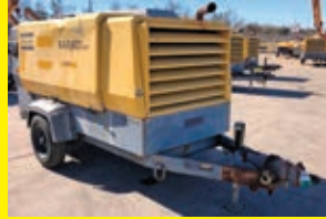
LOT 218: 2014 ATLASCOPCO XAS750JDIT4 SN:HOP081257 John Deere diesel engine, 750CFM, trailer mounted.