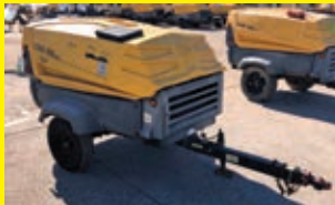
LOT 136: 2015 ATLASCOPCO XAS185 SN:HOP049199 John Deere diesel engine, 185CFM, trailer mounted.