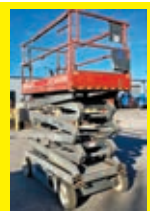
LOT 131: 2014 SKYJACK SJIII4626 SN:70019041 electric powered, 26ft. Platform height, slide out deck, 500lb lift capacity, 173 hours.