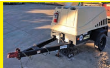
LOT 116: 2018 DOOSAN C185WDZ-T4F SN:484473UBACG07 diesel engine, 185CFM, trailer mounted.