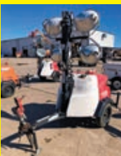
LOT 287: 2017 MAGNUM PRO MLT6SM

SN:3002945849 diesel engine, 4-1,000 watt lightbulbs, trailer mounted.