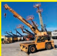
LOT 119: 2012 BRODERSON IC-80-3J SN:63695580 diesel engine, OROPS, 9 ton lifting capacity, 30ft. main boom, outriggers, 2,265 hours.