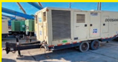
LOT 134: 2013 DOOSAN HP1600WCU-IQT4I SN:455624UGXE97 Cummins diesel engine, 1600CFM, trailer mounted.