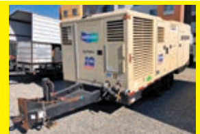
LOT 184: 2016 DOOSAN HP1600WCU-T4FIQ SN:476066UDAAF76 Cummins diesel engine, 1,600CFM, trailer mounted.