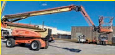
LOT 157: 2014 JLG 1250AJP SN:0300193534 4x4, diesel engine, 125ft. Platform height, articulating boom, JIB, 500lb lift capacity.