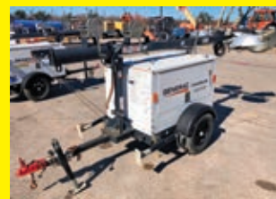
LOT 214: 2015 MAGNUM PRO MLT6SM SN:1501287

SN:3001216859 diesel engine, 4-1,000 watt lightbulbs, trailer mounted.