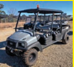
LOT 164: 2016 CLUB CAR CARRYALL 1700 SN:811695 4x4, diesel engine, OROPS, 4-seater, utility body, 1,581 hours.