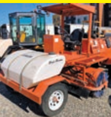
LOT 144: 2016 BROCE KR-350 SN:409771 diesel engine, EROPS, 8ft. Sweeper, water system, 489 hours.