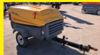
LOT 139: 2015 ATLASCOPCO XAS185KD7 IT4 SN:HOP049285 diesel engine, 185CFM, trailer mounted.