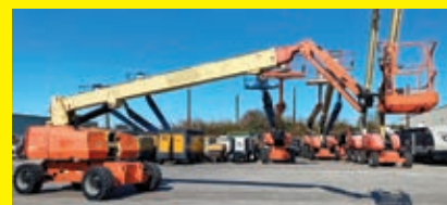
LOT 136: 2012 JLG 860SJ SN:0300152978 4x4, diesel engine, 86ft. Platform height, straight boom, JIB, 500lb lift capacity.