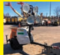
LOT 227: 2014 MAGNUM PRO MLT3060KV SN:1404312 diesel engine, 4-1,000 watt lightbulbs, trailer mounted.