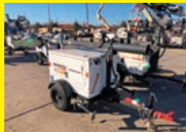
LOT 193: 2017 WACKER LTW8K SN:24254547 diesel engine, 4-1,000 watt lightbulbs, trailer mounted.