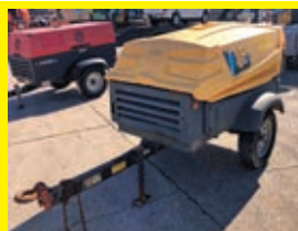
LOT 289: 2018 ATLASCOPCO XAS185KD7 FT4 SN:HOP056619 diesel engine, 185CFM, trailer mounted.