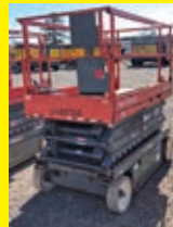
LOT 160: 2016 SKYJACK SJIII4626 SN:70029017 electric powered, 26ft. Platform height, slide out deck, 500lb lift capacity, 156 hours.