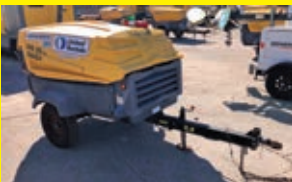
LOT 190: 2015 ATLASCO PCO XAS185KD7 IT4 SN:HOP050311 diesel engine, 185CFM, trailer mounted.