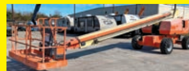
LOT 137: 2011 JLG 800S SN:0300149617 4x4, diesel engine, 80ft. Platform height, straight boom, 500lb lift capacity.