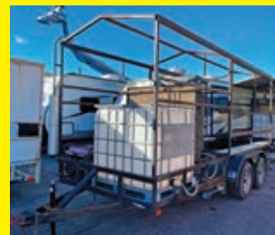
LOT 126: 2016 COOL ZONE 16FT. VN:5RHCT1625GH002947 tandem axle.