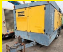
LOT 152: 2015 DOOSAN HP750WCU-T4F SN:468733UULYF32 Cummins diesel engine, 750CFM, trailer mounted.