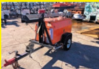
LOT 106: 2017 WANCO WLTC4K6MTO SN:5F13D141XH1005107 diesel engine, 4-1,000 watt lightbulbs, trailer mounted.