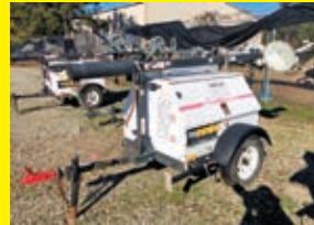
LOT 243: 2014 MAGNUM PRO MLT4150 SN:1406951 diesel engine, 4-1,000 watt lightbulbs, trailer mounted.