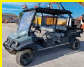
LOT 141: 2016 CLUB CAR CARRYALL 1700 SN:662425 4x4, diesel engine, EROPS, 4-seater, utility body, 2,124 hours.