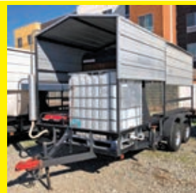
LOT 130: 2016 COOL ZONE 16FT.