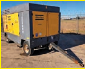
LOT 208: 2013 ATLASCOPCO XAS1600 SN:APP187409 diesel engine, 1,600CFM, trailer mounted.