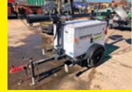
LOT 196: 2018 MAGNUM PRO MLT3060 SN:7FSBL1416JB788215 diesel engine, 4-1,000 watt lightbulbs, trailer mounted.