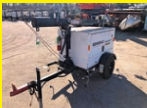
LOT 126: 2016 MAGNUM PRO MLT3060 SN:1604667 diesel engine, 4-1,000 watt lightbulbs, trailer mounted.