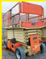
LOT 162: 2015 JLG 4069LE SN:0200247881 electric powered, 40ft. Platform height, slide out deck, 500lb lift capacity, 349 hours.