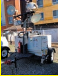
LOT 170: 2016 MAGNUM PRO MLT5200VCAN-POS SN:1508094 diesel engine, 4-1,000 watt lightbulbs, trailer mounted.