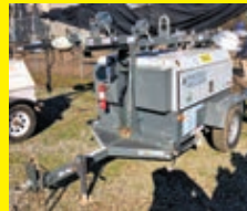
LOT 244: 2017 WACKER LTW8K SN:24251241 diesel engine, 4-1,000 watt lightbulbs, trailer mounted.