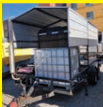
LOT 221: 2016 COOL ZONE 16FT.