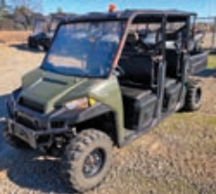
LOT 202: 2016 CLUB CAR CARRYALL 1700 SN:810693 4x4, diesel engine, OROPS, 4-seater, utility body, 1,816 hours.