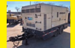
LOT 185: 2015 DOOSAN HP915WCU-T4I SN:894569YKYF26 Cummins diesel engine, 915CFM, trailer mounted.