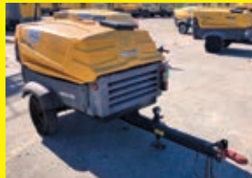
LOT 135: 2015 ATLASCOPCO XAS185 SN:HOP049216 John Deere diesel engine, 185CFM, trailer mounted.