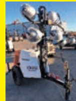
LOT 224: 2016 MAGNUM PRO MLT3060 SN:1604130 diesel engine, 4-1,000 watt lightbulbs, trailer mounted.