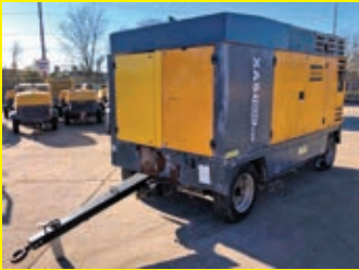
LOT 210: 2011 ATLASCOPCO XAS1600CD6 SN:APP168482 diesel engine, 1,600CFM, trailer mounted.