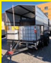
LOT 168: 2016 COOL ZONE 16FT.