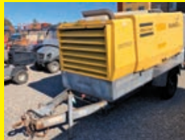
LOT 220: 2013 ATLASCOPCO XAS750JD SN:HOP081062 John Deere diesel engine, 750CFM, trailer mounted.