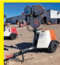
LOT 226: 2016 MAGNUM PRO MLT3060 SN:1604624 diesel engine, 4-1,000 watt lightbulbs, trailer mounted.