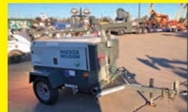
LOT 216: 2015 MAGNUM PRO MLT6SK SN:1506755

diesel engine, 4-1,000 watt lightbulbs, trailer mounted.