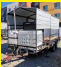
LOT 166: 2016 COOL ZONE 16FT.