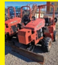
LOT 142: 2016 DITCH WITCH RT45 SN:CMWRT45XPG0003237 4x4, diesel engine, ROPS, push blade, trencher, 826 hours.