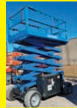
LOT 173: 2014 JLG 4069LE SN:0200227267 electric powered, 40ft. Platform height, slide out deck, 500lb lift capacity, 371 hours.