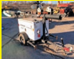
LOT 121: 2016 MAGNUM PRO MLT3060 SN:1605296 diesel engine, 4-1,000 watt lightbulbs, trailer mounted.