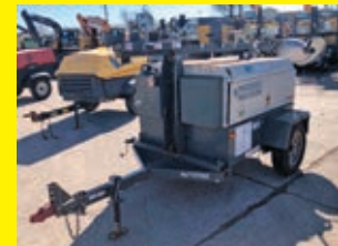
LOT 213: 2015 MAGNUM PRO MLT6SM SN:1503504

SN:3002015682 diesel engine, 4-1,000 watt lightbulbs, trailer mounted.