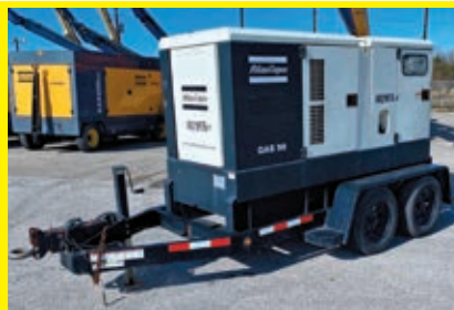
LOT 139: 2016 ATLASCOPCO QAS90 SN:HOP102955 diesel engine, 90KVA, trailer mounted.