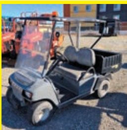
LOT 103: 2016 CLUB CAR CARRYALL 100

SN:SZ1639680245 gas engine, OROPS, utility body, 1,410 hours.