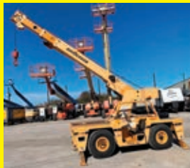
LOT 145: 2004 BRODERSON IC-80-3G SN:530359 diesel engine, OROPS, 9 ton lift capacity, 40ft. Reach height, outriggers, 4-wheel steering, 1,744 hours.