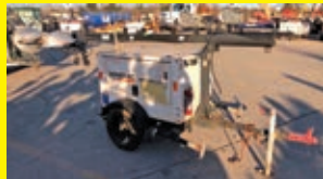
LOT 120: 2016 MAGNUM PRO MLT3060 SN:1600993 diesel engine, 4-1,000 watt lightbulbs, trailer mounted.