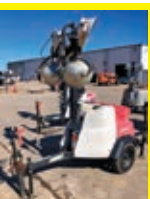
LOT 284: 2017 MAGNUM PRO MLT6SM

diesel engine, 4-1,000 watt lightbulbs, trailer mounted.