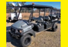
LOT 203: 2017 CLUB CAR CARRYALL 1700 SN:841117 4x4, diesel engine, OROPS, 4-seater, utility body, 1,557 hours.