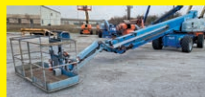
LOT 115: 2014 GENIE S-125 SN:S12514D-712 4x4, diesel engine, 125ft. Platform height, straight boom, JIB, 500lb lift capacity.