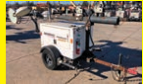
LOT 118: 2016 MAGNUM PRO MLT3060 SN:1604153 diesel engine, 4-1,000 watt lightbulbs, trailer mounted.