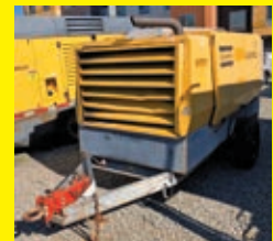
LOT 269: 2014 ATLASCOPCO XATS750JD SN:HOP081247 John Deere diesel engine, 750CFM, trailer mounted.