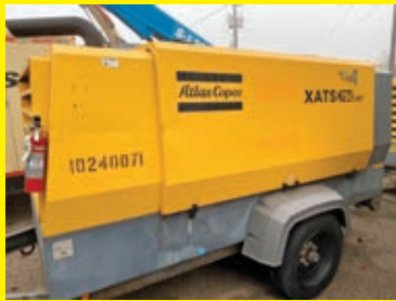
LOT 160: 2010 ATLASCOPCO XAS1600CD6 SN:APP118278 Cummins diesel engine, 1,600CFM, trailer mounted.