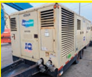
LOT 133: 2014 DOOSAN HP1600WCU-T4I SN:462328UCYE97 Cummins diesel engine, 1,600CFM, trailer mounted.