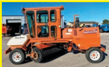
LOT 178: 2016 BROCE KR-350 SN:409770 diesel engine, EROPS, 8ft. Sweeper, water system, 828 hours.