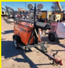
LOT 105: 2017 WANCO WLTC4K6MTO SN:5F13D1411H1005142 diesel engine, 4-1,000 watt lightbulbs, trailer mounted.