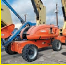
LOT 159: 2008 JLG 800S SN:300134628 4x4, diesel engine, 80ft. Platform height, straight boom, 500lb lift capacity.