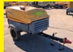
LOT 138: 2015 ATLASCOPCO XAS185KD7 IT4 SN:HOP049636 diesel engine, 185CFM, trailer mounted.