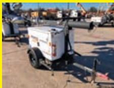
LOT 119: 2016 MAGNUM PRO MLT3060 SN:1604132 diesel engine, 4-1,000 watt lightbulbs, trailer mounted.