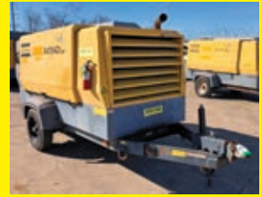
LOT 265: 2016 ATLASCOPCO XATS750JD7 SN:HOP081558 John Deere diesel engine, 750CFM, trailer mounted.