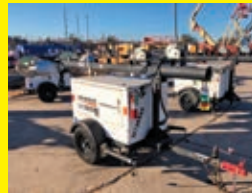
LOT 192: 2017 WACKER LTW8K SN:24264142 diesel engine, 4-1,000 watt lightbulbs, trailer mounted.