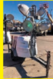
LOT 295: 2016 MAGNUM PRO MLT6SM SN:1603915

SN:3002124033 diesel engine, 4-1,000 watt lightbulbs, trailer mounted.