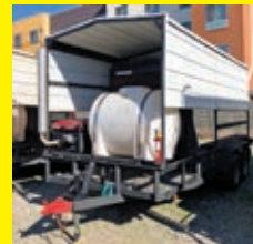
LOT 128: 2015 COOL ZONE 16FT.