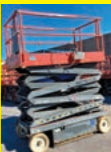
LOT 130: 2015 SKYJACK SJIII4626 SN:70023662 electric powered, 26ft. Platform height, slide out deck, 500lb lift capacity, 175 hours.