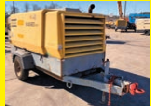
LOT 151: 2014 ATLASCOPCO XAS750 JDIT4 SN:HOP081333 John Deere diesel engine, 750CFM, trailer mounted.