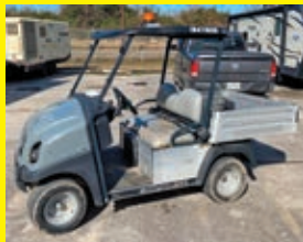
LOT 142: 2016 CLUB CAR CARRYALL 300 SN:MC1639-679871 gas engine, EROPS, utility body, 2,631 hours.