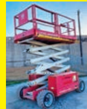
LOT 174: 2016 JLG 2646ES SN:M200003144 electric powered, 26ft. Platform height, slide out deck, 500lb lift capacity, 637 hours.