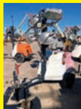
LOT 294: 2016 MAGNUM PRO MLT6SM SN:1604195

SN:3002091579 diesel engine, 4-1,000 watt lightbulbs, trailer mounted.