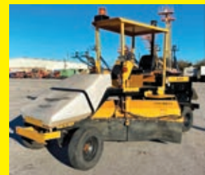
LOT 122: 2016 LAYMOR SM400 SN:36653 diesel engine, EROPS, 8ft. Sweeper, water system, 677 hours.