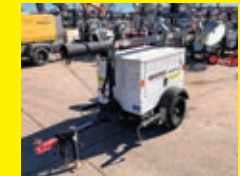
LOT 254: 2017 MAGNUM PRO MLT3060 SN:3001627986 diesel engine, 4-1,000 watt lightbulbs, trailer mounted.