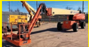
LOT 235: 2010 JLG 1200SJP SN:0300141338 4x4, diesel engine, 120ft. Platform height, straight boom, JIB, 500lb lift capacity.