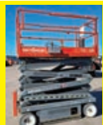
LOT 179: 2013 SKYJACK SJIII4626 SN:70015263 electric powered, 26ft. Platform height, slide out deck, 500lb lift capacity, 158 hours.