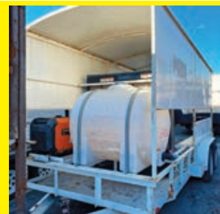
LOT 167: 2016 BROCK TRL 16FT. VN:1B9US1627GB632090 tandem axle.