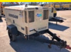
LOT 134: 2014 DOOSAN P425/HP375WCUT4 SN:462481UCYF15 Cummins diesel engine, 425CFM, trailer mounted.