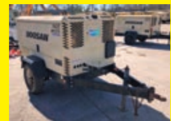
LOT 279: 2015 DOOSAN P425/HP375WCUT4 SN:469455UAZF15 Cummins diesel engine, 425CFM, trailer mounted.