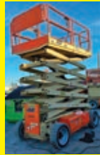
LOT 147: 2016 JLG 4069LE SN:0200252932 electric powered, 40ft. Platform height, slide out deck, 500lb lift capacity, 281 hours.