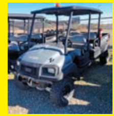
LOT 163: 2016 CLUB CAR CARRYALL 1700 SN:SC1635-669906 4x4, gas engine, OROPS, 4-seater, utility body, 1,549 hours.