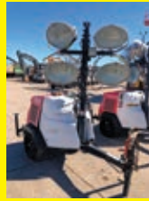
LOT 285: 2017 MAGNUM PRO MLT6SM

SN:3002549788 diesel engine, 4-1,000 watt lightbulbs, trailer mounted.