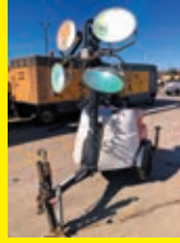
LOT 286: 2017 MAGNUM PRO MLT6SM

SN:3003535496 diesel engine, 4-1,000 watt lightbulbs, trailer mounted.