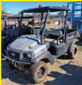
LOT 204: 2017 CLUB CAR CARRYALL 1500

SN:6849685 4x4, diesel engine, OROPS, utility body, 1,050 hours.