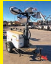
LOT 117: 2016 MAGNUM PRO MLT3060 SN:1604629 diesel engine, 4-1,000 watt lightbulbs, trailer mounted.