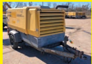
LOT 217: 2014 ATLASCOPCO XAS750JDIT4 SN:HOP081256 John Deere diesel engine, 750CFM, trailer mounted.