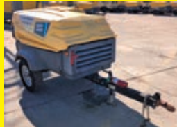
LOT 288: 2018 ATLASCOPCO XAS185KD7 FT4 SN:HOP057069 John Deere diesel engine, 185CFM, trailer mounted.