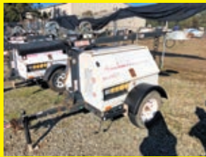
LOT 171: 2015 MAGNUM PRO MLT4150 SN:1505206 diesel engine, 4-1,000 watt lightbulbs, trailer mounted.