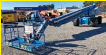
LOT 175: 2014 GENIE S-125 SN:S12514D-807 4x4, diesel engine, 120ft. Platform height, straight boom, JIB, 500lb lift capacity.