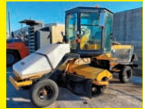
LOT 120: 2016 LAYMOR SM400 SN:37244 diesel engine, EROPS, 8ft. Sweeper, water system, 1,050 hours.