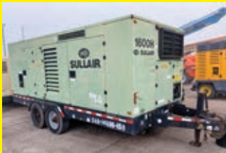
LOT 170: 2013 ATLASCOPCO XAS750JD SN:HOP081073 John Deere diesel engine, 750CFM, trailer mounted.