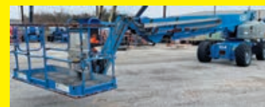
LOT 116: 2014 GENIE S-125 SN:S12514D-839 4x4, diesel engine, 125ft. Platform height, straight boom, JIB, 500lb lift capacity.