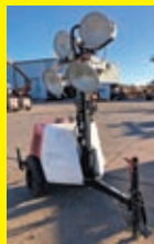
LOT 232: 2018 MAGNUM PRO MLT6SM

diesel engine, 4-1,000 watt lightbulbs, trailer mounted.