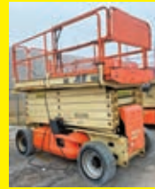
LOT 163: 2014 JLG 4069LE SN:0200232066 electric powered, 40ft. Platform height, slide out deck, 500lb lift capacity, 520 hours.