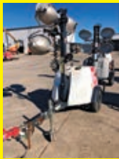
LOT 231: 2018 MAGNUM PRO MLT6SM

diesel engine, 4-1,000 watt lightbulbs, trailer mounted.