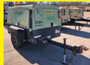
LOT 113: 2012 SULLAIR 375HDPQ-JD SN:201201140004 John Deere diesel engine, 375CFM, trailer mounted.