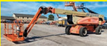
LOT 158: 2013 JLG 1250AJP SN:0300173990 4x4, diesel engine, 125ft. Platform height, articulating boom, JIB, 500lb lift capacity.