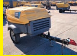
LOT 290: 2018 ATLASCOPCO XAS185KD7 FT4 SN:HOP056494 diesel engine, 185CFM, trailer mounted.