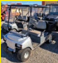
LOT 101: 2016 CLUB CAR CARRYALL 100

SN:SZ1639680212 gas engine, OROPS, utility body, 779 hours.