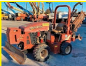
LOT 104: 2016 DITCH WITCH RT45 SN:CMWRT45XHH0003430 4x4, diesel engine, ROPS, push blade, trencher, 711 hours.