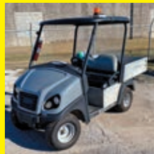
LOT 143: 2016 CLUB CAR CARRYALL 300 SN:MC1639680316 gas engine, EROPS, utility body, 1,041 hours.