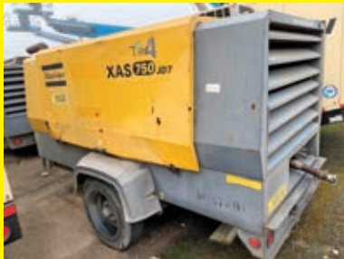
LOT 161: 2014 ATLASCOPCO XAS750JD SN:HOP081229 John Deere diesel engine, 750CFM, trailer mounted.