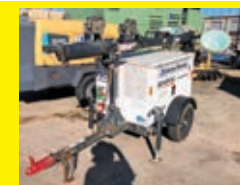
LOT 256: 2017 MAGNUM PRO MLT3060 SN:30011453130 diesel engine, 4-1,000 watt lightbulbs, trailer mounted.