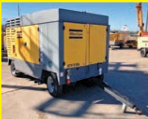
LOT 212: 2011 ATLASCOPCO XAS1600CD6 SN:APP168610 diesel engine, 1,600CFM, trailer mounted.