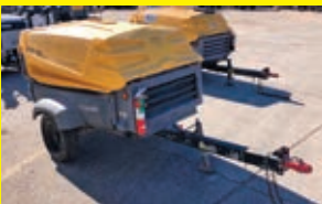
LOT 189: 2015 ATLASCO PCO XAS185KD7 IT4 SN:HOP049082 diesel engine, 185CFM, trailer mounted.