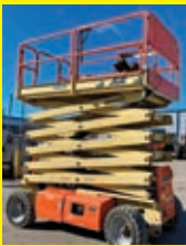
LOT 113: 2016 JLG 4069LE SN:0200252995 electric powered, 40ft. Platform height, slide out deck, 500lb lift capacity, 271 hours.