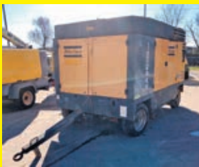
LOT 211: 2011 ATLASCOPCO XAS1600CD6 SN:APP154113 Cummins diesel engine, 1,600CFM, trailer mounted.