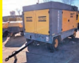
LOT 238: 2010 ATLASCOPCO XAS1600CD6 SN:AIP786714 diesel engine, 1,600CFM, trailer mounted.