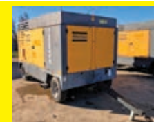
LOT 207: 2013 ATLASCOPCO XAS1600 SN:AAP234695 diesel engine, 1,600CFM, trailer mounted.