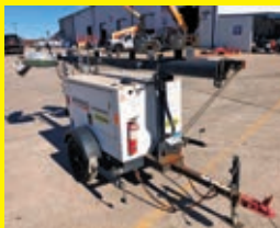
LOT 122: 2016 MAGNUM PRO MLT3060 SN:1604671 diesel engine, 4-1,000 watt lightbulbs, trailer mounted.