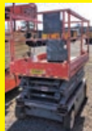
LOT 180: 2014 SKYJACK SJIII4626 SN:70019153 electric powered, 26ft. Platform height, slide out deck, 500lb lift capacity, 201 hours.