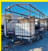
LOT 125: 2016 COOL ZONE 16FT. VN:5RHCT1626GH002939 tandem axle.