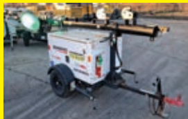
LOT 260: 2017 MAGNUM PRO MLT3060 SN:3002246597 diesel engine, 4-1,000 watt lightbulbs, trailer mounted.