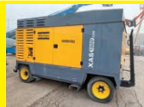
LOT 169: 2010 ATLASCOPCO XAS1600CD6 SN:APP103655 diesel engine, 1,600CFM, trailer mounted.