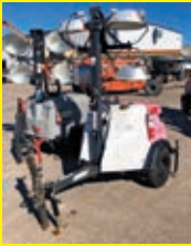
LOT 292: 2016 MAGNUM PRO MLT6SM

SN:3003678559 diesel engine, 4-1,000 watt lightbulbs, trailer mounted.