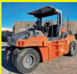
LOT 146: 2014 HAMM GRW280-10 SN:H2120034 Deutz diesel engine, OROPS, pneumatic tires.