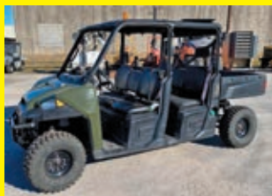
LOT 101: 2017 POLARIS RANGER SN:4XARVAD18H7190027 4x4, diesel engine, EROPS, 4-seater, utility body, 1,478 hours.