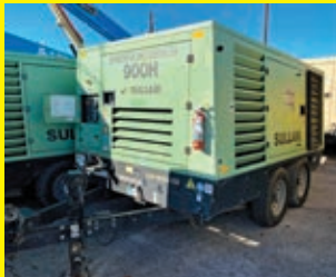
LOT 108: 2016 SULLAIR 900RHAFDTQ-CAT SN:201601130062RF diesel engine, 900CFM, trailer mounted.