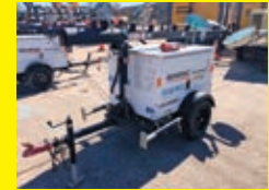
LOT 195: 2017 WACKER LTW8K SN:24257988 diesel engine, 4-1,000 watt lightbulbs, trailer mounted.