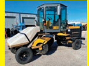
LOT 121: 2016 LAYMOR SM400 SN:37114 diesel engine, EROPS, 8ft. Sweeper, water system, 457 hours.