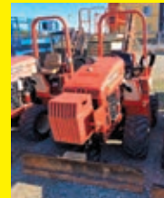
LOT 141: 2016 DITCH WITCH RT45 SN:03435 4x4, diesel engine, ROPS, push blade, trencher, 832 hours.