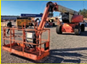
LOT 233: 2012 JLG 1250AJP SN:0300156224 4x4, diesel engine, 125ft. Platform height, articulating boom, JIB, 500lb lift capacity.