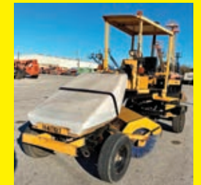
LOT 155: 2015 LAYMOR SM400 SN:36253 diesel engine, EROPS, 8ft. Sweeper, water system, 461 hours.