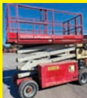
LOT 176: 2014 MEC 4069ERT SN:13400129 electric powered, 40ft. Platform height, slide out deck, 500lb lift capacity, 350 hours.