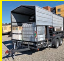
LOT 223: 2016 COOL ZONE 16FT.