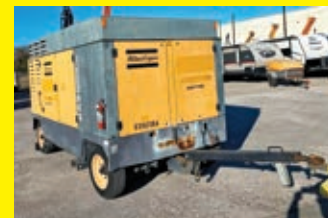
LOT 154: 2015 ATLASCOPCO XATS1600 SN:HOP090830 John Deere diesel engine, 1,600CFM, trailer mounted.