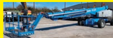
LOT 117: 2012 GENIE S-125 SN:S12512-3379 4x4, diesel engine, 125ft. Platform height, straight boom, JIB, 500lb lift capacity.