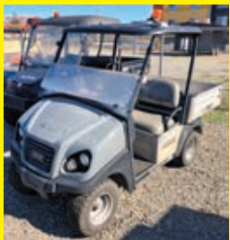
LOT 205: 2016 CLUB CAR CARRYALL 300

SN:6849685 4x4, diesel engine, OROPS, utility body, 1,050 hours.