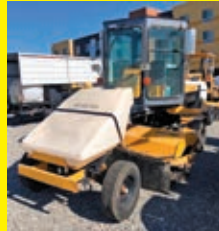
LOT 200: 2016 LAYMOR SM400 SN:36981 diesel engine, EROPS, 8ft. Sweeper, water system, 1,113 hours.