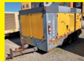
LOT 206: 2015 ATLASCOPCO XATS1600 SN:HOP090829 John Deere diesel engine, 1,600CFM, trailer mounted.