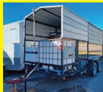
LOT 166: 2016 COOL ZONE 16FT. VN:5RHCT1621GH002900 tandem axle.