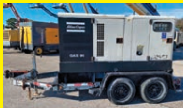
LOT 140: 2016 ATLASCOPCO QAS90 SN:HOP102957 diesel engine, 90KVA, trailer mounted.