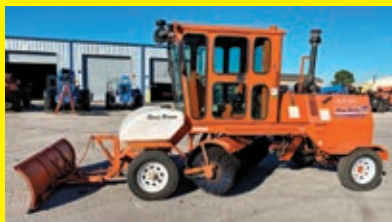
LOT 177: 2016 BROCE KR-350 SN:469698 diesel engine, EROPS, 8ft. Sweeper, water system, 857 hours.