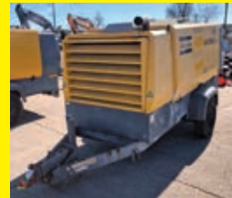
LOT 268: 2014 ATLASCOPCO XATS750JD SN:HOP081228 John Deere diesel engine, 750CFM, trailer mounted.