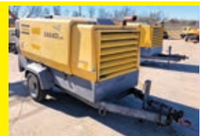
LOT 147: 2014 ATLASCOPCO XAS750 JDIT4 SN:HOP081314 John Deere diesel engine, 750CFM, trailer mounted.