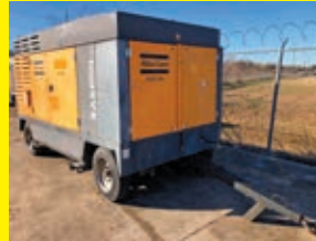
LOT 239: 2010 ATLASCOPCO XAS1600CD6 SN:APP116370 diesel engine, 1,600CFM, trailer mounted.