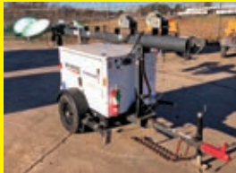
LOT 257: 2017 MAGNUM PRO MLT3060 SN:3001912124 diesel engine, 4-1,000 watt lightbulbs, trailer mounted.