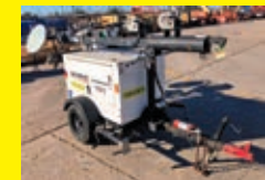
LOT 255: 2017 MAGNUM PRO MLT3060 SN:3001872882 diesel engine, 4-1,000 watt lightbulbs, trailer mounted.