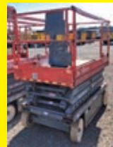
LOT 179: 2015 SKYJACK SJIII4626 SN:70023641 electric powered, 26ft. Platform height, slide out deck, 500lb lift capacity, 201 hours.