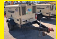
LOT 281: 2015 DOOSAN P425/HP375WCUT4 SN:469323UAZF15 Cummins diesel engine, 375CFM, trailer mounted.