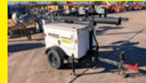
LOT 198: 2017 MAGNUM PRO MLT3060MV SN:3001675906 diesel engine, 4-1,000 watt lightbulbs, trailer mounted.