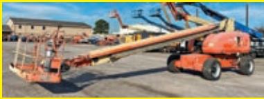
LOT 138: 2010 JLG 800S SN:0300142962 4x4, diesel engine, 80ft. Platform height, straight boom, 500lb lift capacity.