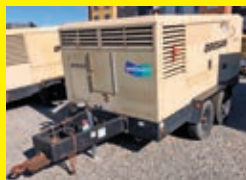
LOT 187: 2013 DOOSAN HP750WCU-T4I SN:456480UHXE48 Cummins diesel engine, 750CFM, trailer mounted.