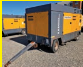
LOT 240: 2010 ATLASCOPCO XAS1600CD6 SN:APP117929 Cummins diesel engine, 1,600CFM, trailer mounted.