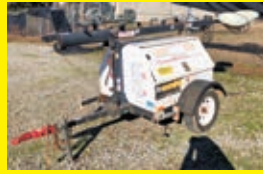
LOT 241: 2015 MAGNUM PRO MLT4150 SN:1505196 diesel engine, 4-1,000 watt lightbulbs, trailer mounted.