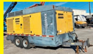
LOT 153: 2013 ATLASCOPCO XAS 1800 JD7 SN:HOP090604 John Deere diesel engine, 1,800CFM, trailer mounted.