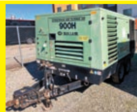
LOT 114: 2016 SULLAIR 900RHAFDTQ-CAT SN:201601130061RF Cat diesel engine, 900CFM, trailer mounted.