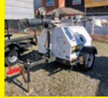
LOT 242: 2015 MAGNUM PRO MLT4150 SN:1505208 diesel engine, 4-1,000 watt lightbulbs, trailer mounted.