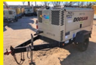
LOT 131: 2014 DOOSAN P425/HP375WCUT4 SN:464649UYFY15 Cummins diesel engine, 425CFM, trailer mounted.