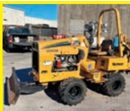
LOT 105: 2016 VERMEER RTX450 SN:1VR4092U0G1003510 4x4, diesel engine, ROPS, push blade, trencher, 1,081 hours.