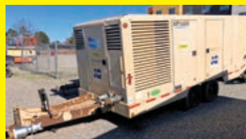
LOT 115: 2012 INGERSOLL RAND HP1600IQ SN:437359UCWE09 diesel engine, 1,600CFM, trailer mounted.