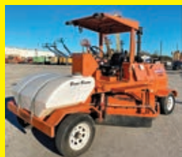
LOT 182: 2016 BROCE KR-350 SN:409773 diesel engine, EROPS, 8ft. Sweeper, water system, 443 hours.