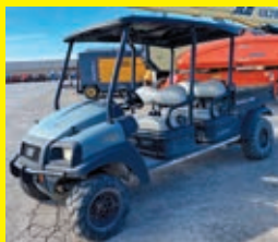
LOT 103: 2016 CLUB CAR CARRYALL 1700 SN:SD1706801507 4x4, diesel engine, EROPS, 4-seater, utility body, 1,919 hours.