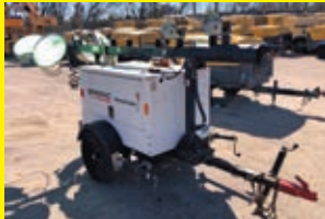
LOT 125: 2016 MAGNUM PRO MLT3060 SN:1601625 diesel engine, 4-1,000 watt lightbulbs, trailer mounted.