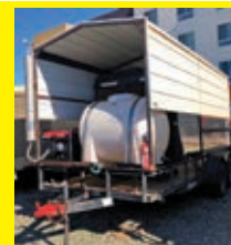
LOT 127: 2014 ROAD BOSS 16FT.