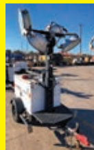
LOT 194: 2017 WACKER LTW8K SN:24265676 diesel engine, 4-1,000 watt lightbulbs, trailer mounted.