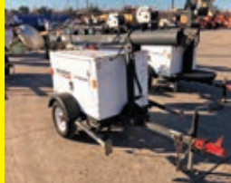
LOT 124: 2016 MAGNUM PRO MLT3060 SN:1604317 diesel engine, 4-1,000 watt lightbulbs, trailer mounted.