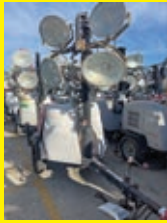
LOT 229: 2018 MAGNUM PRO MLT6SM

SN:3002549788 diesel engine, 4-1,000 watt lightbulbs, trailer mounted.