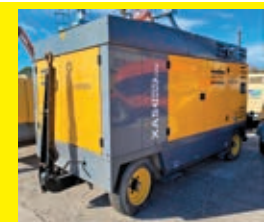
LOT 168: 2010 ATLASCOPCO XAS1600CD6 SN:APP137216 Cummins diesel engine, 1600CFM, trailer mounted.