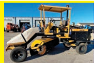
LOT 156: 2015 LAYMOR SM400 SN:36251 diesel engine, EROPS, 8ft. Sweeper, water system, 467 hours.