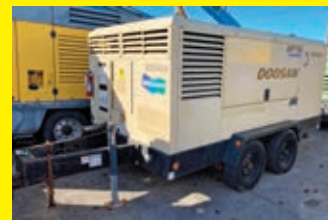
LOT 135: 2013 DOOSAN HP1600WCU-IQT4I SN:454247UEXE97 Cummins diesel engine, 1600CFM, trailer mounted.