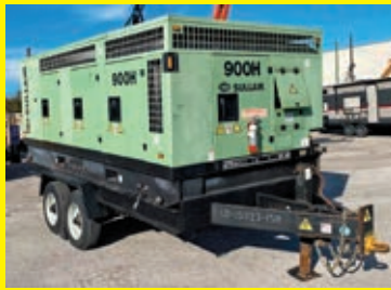
LOT 109: 2015 SULLAIR 900HAFDTQ-CAT SN:201512090047 Cat diesel engine, 900CFM, trailer mounted.