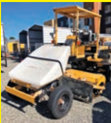
LOT 201: 2015 LAYMOR SM400 SN:36247 diesel engine, EROPS, 8ft. Sweeper, water system, 345 hours.