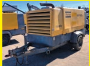
LOT 267: 2014 ATLASCOPCO XATS750JD SN:HOP081230 John Deere diesel engine, 750CFM, trailer mounted.