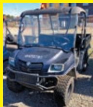
LOT 100: 2016 CLUB CAR CARRYALL 100

SN:SZ1646697161 gas engine, OROPS, utility body, 934 hours.