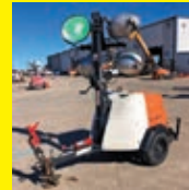
LOT 225: 2016 MAGNUM PRO MLT3060 SN:3001142277 diesel engine, 4-1,000 watt lightbulbs, trailer mounted.