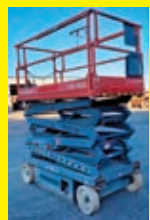
LOT 128: 2014 MEC 4069ERT SN:13400174 electric powered, 40ft. Platform height, slide out deck, 500lb lift capacity, 714 hours.