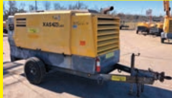
LOT 219: 2013 ATLASCOPCO XAS750JDIT4 SN:HOP081184 John Deere diesel engine, 750CFM, trailer mounted.