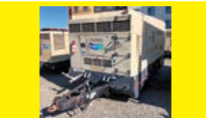
LOT 186: 2015 DOOSAN HP915WCU-T4I SN:894561YJYF26 Cummins diesel engine, 915CFM, trailer mounted.