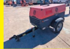
LOT 291: 2017 CPT CPS185KD7 SN:HOP054269 diesel engine, 185CFM, trailer mounted, 822 hours.