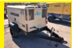
LOT 280: 2015 DOOSAN P425/HP375WCUT4 SN:469671UBZF15 Cummins diesel engine, 425CFM, trailer mounted.