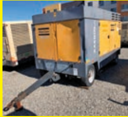
LOT 209: 2013 ATLASCOPCO XAS1600 SN:APP241944 diesel engine, 1,600CFM, trailer mounted.