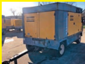
LOT 263: 2009 ATLASCOPCO XAS1600CD6 SN:AIP784138 Cummins diesel engine, 1,600CFM, trailer mounted.