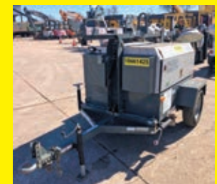
LOT 215: 2016 MAGNUM PRO MLT6SK SN:1603591

diesel engine, 4-1,000 watt lightbulbs, trailer mounted.