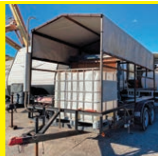
LOT 165: 2016 COOL ZONE 16FT. VN:5RHCT1629GH002899 tandem axle.