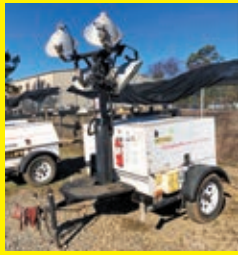
LOT 169: 2016 MAGNUM PRO MLT5200VCAN-POS SN:1507702 diesel engine, 4-1,000 watt lightbulbs, trailer mounted.