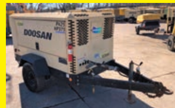
LOT 132: 2014 DOOSAN P425/HP375WCUT4 SN:462098UBFY15 Cummins diesel engine, 425CFM, trailer mounted.