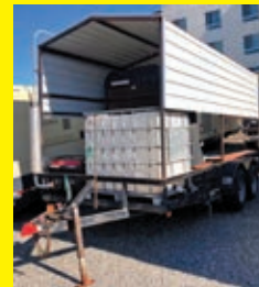
LOT 222: 2016 COOL ZONE 16FT.