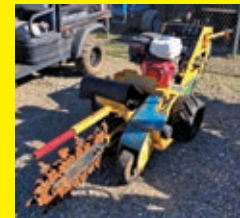
LOT 143: 2016 VERMEER RTX130 SN:1UR5071P8H1000120 gas engine, track mounted, 465 hours.