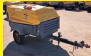
LOT 137: 2015 ATLASCOPCO XAS185 SN:HOP049205 John Deere diesel engine, 185CFM, trailer mounted.