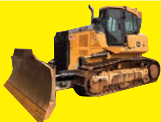
2017 JOHN DEERE 850KLT SN:THF318722 John Deere diesel engine, EROPS, air, heat, 159in. 6 way blade, 22in. Pads, Allied H6HH winch w/ (4) roller fairlead, long track frame, 2,058 hours. Hydraulic & Powertrain Warranty, 11-29-21 or 4,000 hours.