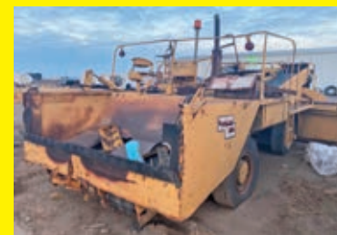
KOLRING FLAHERTY SN:72003 Detroit diesel engine, 13ft. Hopper.