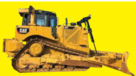
2018 CAT D8T SN:FMC01337 Cat diesel engine, EROPS, air, heat, Angle blade w/ hydraulic tilt, 24in. Pads, winch, 700 hours.