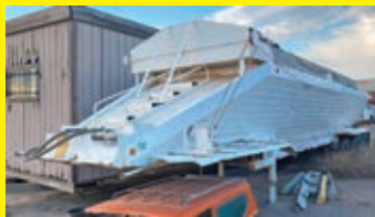
1994 FLOW BOY SN:RN102163 live bottom body, 11R24.5 tires, tandem axle.