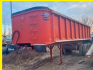
1998 HILBILT SN:1015156 24ft. Dump body, tarp, 11R24.5 tires, tandem axle.