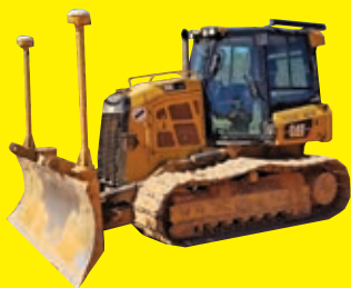
2016 CAT D5K2LGP SN:AKY200811 Cat diesel engine, EROPS, air, rear screen, 6 way blade, wide pads, wired for grade control.