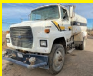
1998 FORD L8000 VN:1FTYR82EXSVA16082 diesel engine, power steering, 2000 gallon water tank, dual wheel single axle.