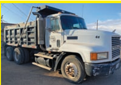
MACK CH613 VN:122731 Mack E7 diesel engine, 350hp, 10 speed transmission, power steering, dump body, tarp, 11R22.5 tires, tandem axle.