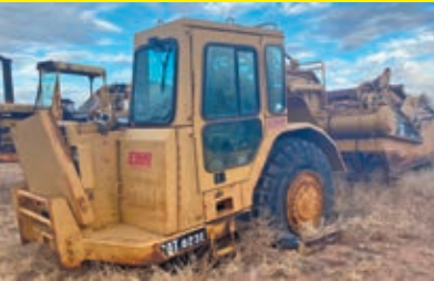
CAT 623E SN:6YF00163 29.5 x 29 rubber, Parts Machine.