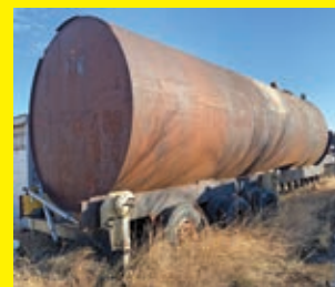
CUSTOM BUILT HOT OIL TRAILER trailer mounted.