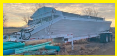
1992 FLOW BOY SN:NN101886 live bottom body, 11R24.5 tires, tandem axle.