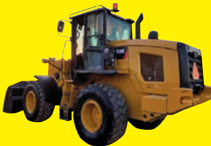
2014 CAT 930K Cat diesel engine, EROPS, Lincoln lube system, quick coupler, GP bucket.