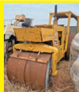
INGRAM SN:442782D86 Detroit diesel engine, 45in. Front drum, 20in. Rear drum.