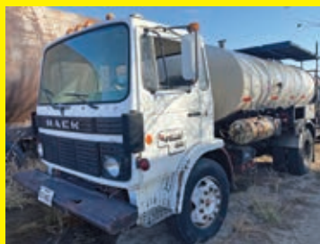
MACK Mack diesel engine, power steering, Etnyre tank, 29.5/75R22.5 tires, dual wheel single axle, 127,836 miles.