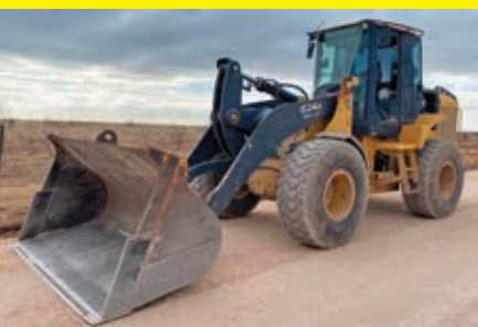
JOHN DEERE 624K SN:632077 John Deere diesel engine, EROPS, air, GP bucket, 20.5R25 rubber.