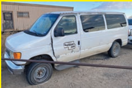
2006 FORD VN:HB41686 Parts.