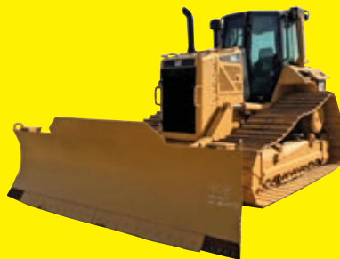
2012 CAT D6NXL SN:AKM02212 Cat diesel engine, EROPS, air, heat, am/fm radio, 6 way blade, 34in. Pads. 6 way blade, long track frame. CAT D6NXL SN:AKM02212 Cat diesel engine, EROPS, 6 way blade, long track frame. CAT D6NXL SN:ALY00685 Cat diesel engine, EROPS, air, 6 way blade, wide pads. CAT D6KLGP SN:DHA00879 Cat diesel engine, EROPS, air, sweeps, rear screen, rear hydraulics, 6 way blade, GPS ready.