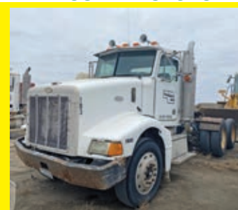
PETERBILT diesel engine, power steering, wet kit, tandem axle.