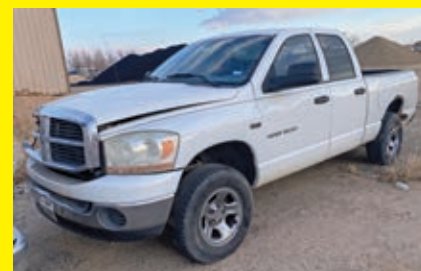
DODGE 1500 VN:142405 Hemi 5.7 gas engine. Missing Parts.