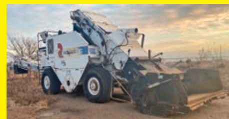
ROADTEC SB-2500B SN:SB2500B-552 John Deere diesel engine, load hopper, discharge conveyor, 21.00-25 tires.