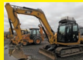
2014 CAT 308E2 CR SB SN:FJX00277 Cat diesel engine, Cab, air, swing boom, pattern control changer, 91in. front blade, 7ft. 3in. stick, auxiliary hydraulics, 18in. TBG pads w/ rubber inserts, zero tail swing, Cat hydraulic quick coupler, extra counterweight, 30in. digging bucket w/ Cat hydraulic thumb, 3,319 hours. Engine installed 1/2020 w/ approx. 2,900 hours.