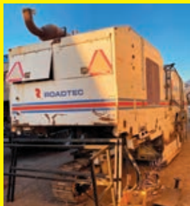
ROADTEC RX-45 SN:RX-45-107 Cat diesel engine, discharge hopper, 843 hours.