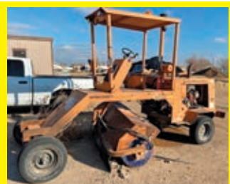
WALDON SWEEPMASTER SN:24762-002 Cummins diesel engine, OROPS, 8ft. Broom, 215/70R15 rubber.