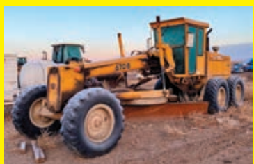
JOHN DEERE 670B SN:515283 John Deere diesel engine, EROPS, 12ft. Moldboard, 14 x 25 rubber.