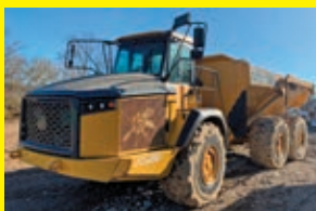
2014 JOHN DEERE 410E SN:664453 6x6, John Deere diesel engine, Cab, air, rear camera, radio, 41 ton capacity, tailgate, 29.5R25 rubber.