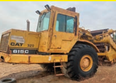
CAT 615C SN:5TF00286 Cat 3306 diesel engine, equipped 29.5 x 25 rubber.