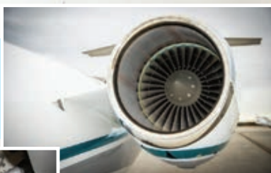
POWER PLANT Engines: 2 Engine Mfg.: Honeywell Engine Model: TFE731-40BR