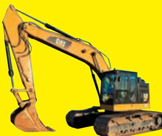
2016 CAT 335FL SN:KNE004949 Cat diesel engine, Cab, air, heat, pattern changer, reach boom, 10ft. 6in. stick, tool control hydraulics, 33in. Pads, pin grabber coupler, product link, 42in. Digging bucket, long undercarriage.