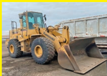
KAWASAKI 80ZV-2 SN:5429 Cummins diesel engine, EROPS, air, GP bucket, 23.5 x 25 rubber.