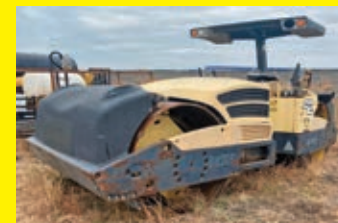
BOMAG BW205AP SN:109A22901522 Cummins diesel engine, OROPS, 84in. Smooth drum, double drum, vibratory drum, drum drive, water system.