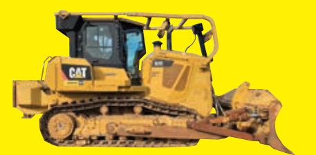
2013 CAT D7E Cat diesel engine, EROPS, air, heat, sweeps, rear screen, 24in pads, winch, Angle blade with hydraulic tilt.

2016 CAT D6TXL SN:GMK01635 Cat diesel engine, EROPS, air, sweeps, High Speed Oil Change, SU blade w/ tilt, Multi-shank ripper, ARO Accugrade ready, Product Link, Heavy Duty Undercarriage.