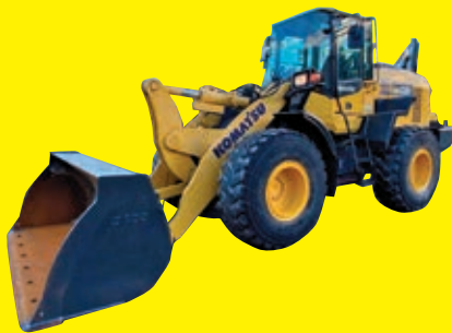
2018 KOMATSU WA320-8 SN:A38323 Komatsu diesel engine, EROPS, air, heat, hydraulic quick coupler, GP bucket.