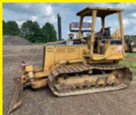
CAT D4C SERIES III SN:7SL00499 Cat diesel engine, EROPS, 6 way blade.