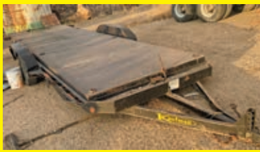
KAUFMAN VN:B000371 22ft. Deck, tandem axle.