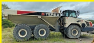
2009 TEREX TA40 SN:A8651097 6x6, diesel engine, Cab, air, heat, 40 ton capacity, 29.5R25 rubber.