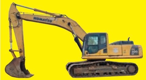
KOMATSU PC300LC-8 SN:A90176 Komatsu diesel engine, Cab, 32in. Pads, 48in. Digging bucket, long undercarriage.