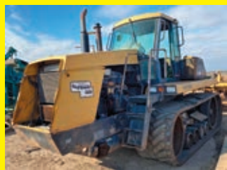
CAT 65C CHALLENGER SN:2ZJ00301 Cat diesel engine, EROPS, 30in. Pads.

CASE 4690 SN:8856767 4x4, diesel engine, OROPS, 3pt hitch, PTO, 18.4-34 rubber. Parts Only.