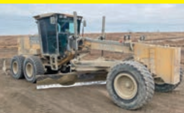
JOHN DEERE 770D SN:597057 John Deere diesel engine, EROPS, air, 14ft. Moldboard, hydraulic sideshift, rear ripper, 17.5R25 rubber, 2,943 hours.