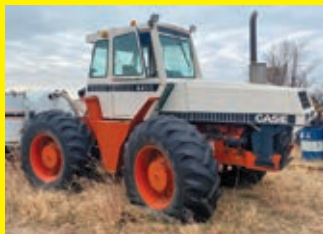
CASE 4490 SN:8863047 4x4, Case diesel engine, Cab, 3pt hitch, PTO, 23.1-34 tires.

CASE 4690 SN:8856767 4x4, diesel engine, OROPS, 3pt hitch, PTO, 18.4-34 rubber. Parts Only.