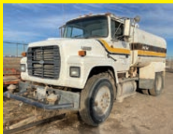
1990 FORD L8000 VN:1FTYR82E5RVA37786 diesel engine, power steering, 2000 gallon water tank, dual wheel single axle.