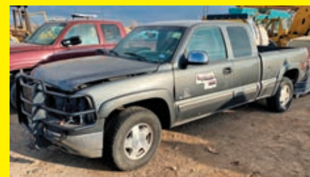
CHEVY 1500 VN:353742 Vortec gas engine, automatic transmission, Z71 package, 265/70R16 tires. Parts Only.