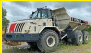
TEREX TA40 SN:A8651387 6x6, diesel engine, Cab, air, heat, 40 ton capacity, 29.5R25 rubber.