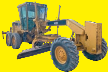
CAT 140H SN:9TN00454 Cat 3306 diesel engine, EROPS, air, 14ft. Moldboard, hydraulic sideshift, 14.00-24 rubber.