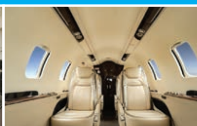
INTERIOR Height: 4ft. 11in., Width: 5ft. 1in., Length: 17ft. 8in. Volume: 363 cu. ft., Internal Baggage: 65 cu. ft.