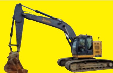
2016 JOHN DEERE 245GLC SN:AFB600948 Isuzu diesel engine, 159hp, Cab, air, heat, 10ft. stick, 32in. TBG pads, JRB quick coupler, 48in. digging bucket, long undercarriage, 2,650 hours.