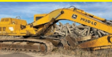
JOHN DEERE 790DLC John Deere diesel engine, Cab, digging bucket, long undercarriage.