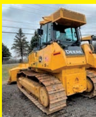
2018 JOHN DEERE 550KXLT SN:335355 John Deere diesel engine, EROPS, air, 105in. 6 way blade, 18in. Pads, long track frame, 695 hours.