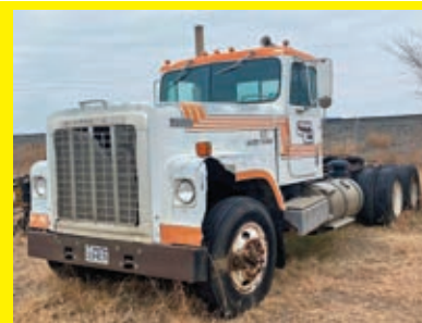
INTERNATIONAL 4300 VN:1HTD21370CGB10204 Cummins diesel engine, Eaton 8 speed transmission, power steering, Vacuum pump, 10.00R22 tires, tandem axle.