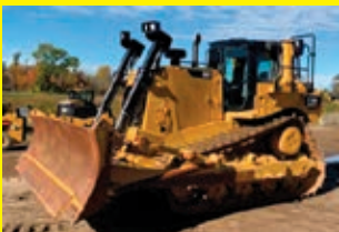
2018 CAT D8T SN:FMC01335 Cat diesel engine, EROPS, air, heat, Angle blade w/ hydraulic tilt, 24in. Pads, winch, 900 hours.