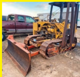
CASE 450B SN:2788009 OROPS, 6 way blade, 14in. Pads. No Engine.