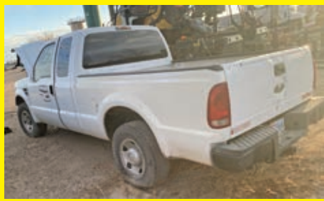
FORD F250 VN:D02615 Parts.