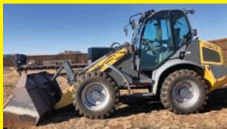
2015 WACKER 1150 diesel engine, Cab, high flow auxiliary hydraulics, skid steer style quick coupler, GP bucket, 1,425 hours.