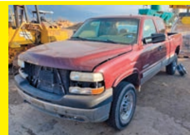
CHEVY 2500HD LT VN:1GCHC29G12E147469 Vortec 8100 gas engine, automatic transmission, 245/75R16 tires. Parts Only.