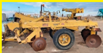
ROME TRCW-12 SN:6TRCW-140 12ft. Disc, 30in. Plows, 385/65R22.5 tires.