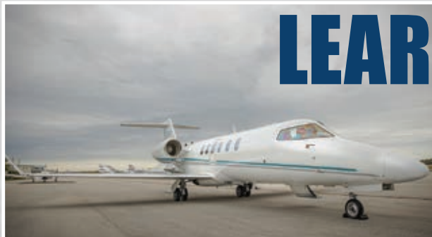
2015 BOMBARDIER LEARJET 70 1,990 Hours, 1,681 Cycles