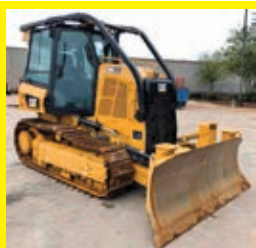
2018 CAT D3K2XL SN:KF202471 Cat diesel engine, EROPS, 6 way blade, 16in. pads, 504 hours.