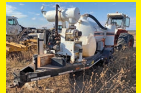
VACMASTER SPV800 Kubota diesel engine, 9.50R16.5 tires, trailer mounted.