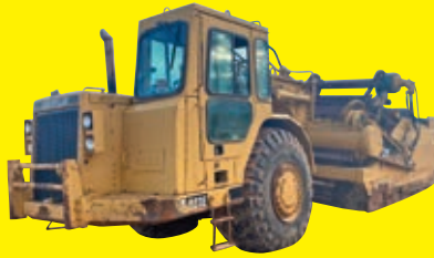
CAT 623E SN:6YF00173 Cat diesel engine, OROPS, ejector body, paddle wheels, 29.5 x 25 rubber.