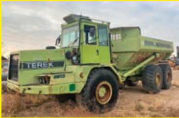
TEREX 3066C SN:A7341126 6x6, diesel engine, Cab, 30 ton capacity, 23.5R25 rubber.