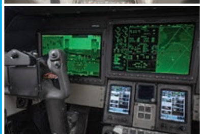
AVIONICS Garmin G5000 w/high resolution displays