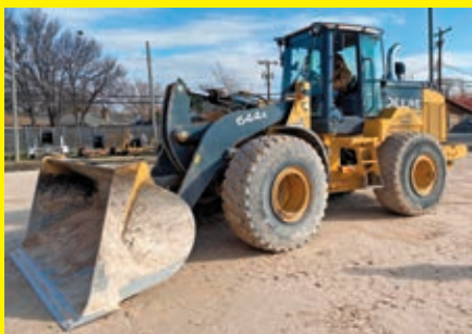
2012 JOHN DEERE 644K SN:BE642054 John Deere diesel engine, EROPS, air, GP bucket, 23.5R25 rubber.