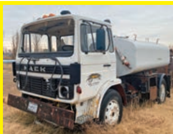
MACK VN:VG6M111BXEB019506 Detroit diesel engine, 10 speed transmission, power steering, 1,500 gallon water tank, 11R22.5 tires, 232,088 miles.