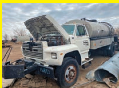
FORD VN:A61020 gas engine, 5 speed transmission, power steering, Etnyre tank, 11R22.5 tires, dual wheel single axle, 1,914 miles.