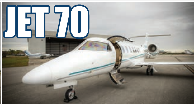
EXTERIOR Height: 14ft., Wing Span: 50ft. 11in., Length: 56ft.