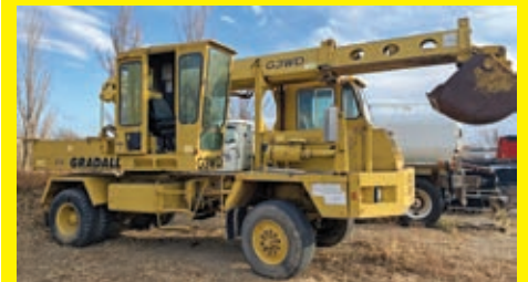
GRADALL G3WD Cummins diesel engine, Cab, 60in. Digging bucket, 385/65R22.5 tires, 29,025 miles.