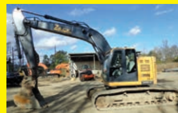
2016 JOHN DEERE 245GLC SN:CFE600843 Isuzu diesel engine, 159hp, Cab, air, heat, 10ft. stick, 32in. TBG pads, JRB quick coupler, 42in. digging bucket, long undercarriage, 2,836 hours.