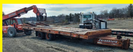
2001 INTERSTATE 20 TON VN:N/A 20 ton capacity, tilt deck, air brakes, pintle hitch, tandem axle.