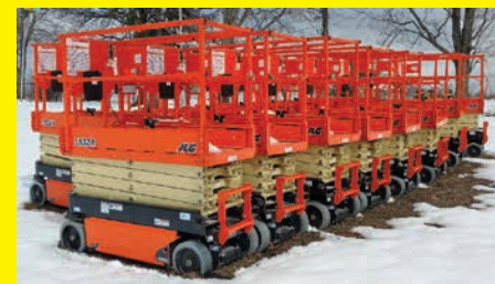
(16) UNUSED JLG 1932R electric powered, 19ft. Platform height, slide out deck, 500lb lift capacity.