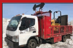
Fuso Platform & Ramp