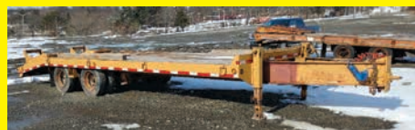
2005 CAM 20 TON VN:012774 20 ton capacity, redecked, tandem axle.