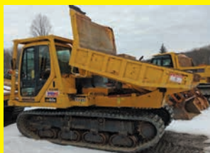
2007 KOMATSU CD60 Komatsu diesel engine, Cab, heat, 5 cubic yard 13,000lb capacity, 360 degree rotating bed, 24in. Rubber tracks.