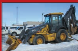
John Deere 710J