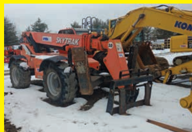
2007 SKYTRAK 10054 diesel engine, EROPS, heat, 10,000lb lift capacity, 54ft. Reach height, front stabilizers.