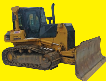
2007 KOMATSU D61EX-15 Komatsu diesel engine, EROPS, air, 6 way blade, long track frame, new undercarriage.