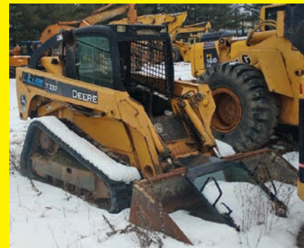
JOHN DEERE 332 John Deere diesel engine, EROPS, air, auxiliary hydraulics, mechanical quick coupler, rubber tracks, 72in. GP Bucket.