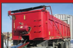
Larochelle Dompeur Steel