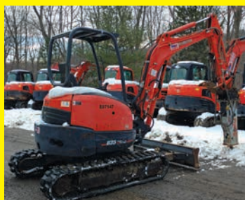
2012 KUBOTA U35 Kubota diesel engine, OROPS, front blade, clean out bucket with hydraulic thumb.