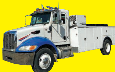
2009 PETERBILT 335 VN:N/A Cummins diesel engine, power steering, Stellar 10620 service body, 10,000lb crane, air compressor, dual wheel single axle, 229,406 miles. Engine rebuilt in 2016 and transmission replaced in 2017.