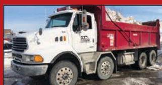
Sterling Dump Truck