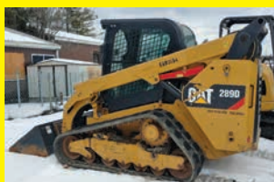
2015 CAT 289DXPS SN:TAW03134 Cat C3.3BDIT diesel engine, 73.4hp, EROPS, air, advance display panel, 2 speed, high flow hydraulics, electric quick coupler, GP bucket, 1,368 hours.