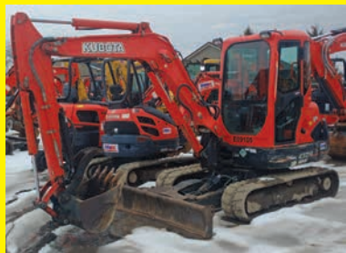
(3) 2013 KUBOTA KX121-3 Kubota diesel engine, Cab, air, front blade, hammer lines, rubber tracks, digging bucket with hydraulic thumb.