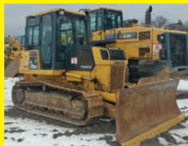
KOMATSU D39EX-21 Komatsu diesel engine, EROPS, air, 6 way blade, long track frame.