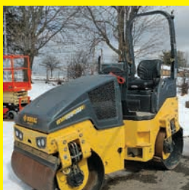
NEW UNUSED BOMAG BW120AD-5 SN:861880421288 diesel engine, ROPS, 48in. Smooth drum, vibratory drum, drum drive, water system.