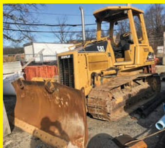
CAT D4GXL SN:5XK37088 Cat diesel engine, OROPS, 6 way blade, long track frame.