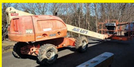
JLG 400S 4x4 , diesel engine, 40ft. Platform height, straight boom, 500lb lift capacity, new tires.