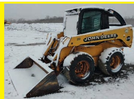
JOHN DEERE 270 John Deere diesel engine, EROPS, air, heat, auxiliary hydraulics, mechanical quick coupler, 72in. GP bucket.