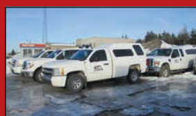
Ford & Chevy Pickup Trucks