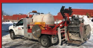
Concrete Saw Truck