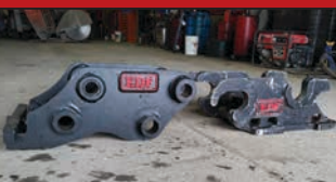
Quick Attach Couplers