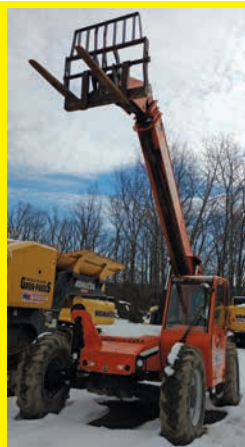
(2) 2008 SKYTRAK 8042 diesel engine, EROPS, heat, 8,000lb lift capacity, 42ft. Reach height.